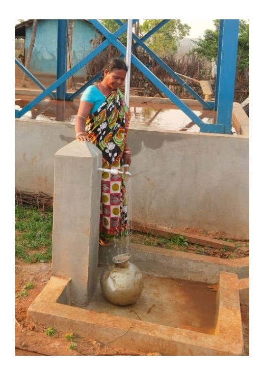
Solar power drinking water project at Gurutuan village

Community people and key stakeholders have requested us for provide drinking water facility in Gurutuan village. The villagers have problem of drinking water especially in summer season. They used water form Baitarni River. It was half kilometer from village.