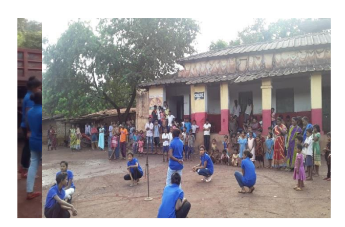
Dengue awareness with Nukad Natak at Plasa Ka village

Further to motivate communities to adopt sustainable sanitation practices and facilities through awareness creation and health education. Nukad natak on Swachhta, Dengue and malaria was played at various locations of mines site, schools & villages. Further people are counselled in small groups to adopt hygiene practices like hand wash and open defecation we are also doing anti larva fogging in peripheral villages to control mosquito breeding and reduce chances of human health disease.