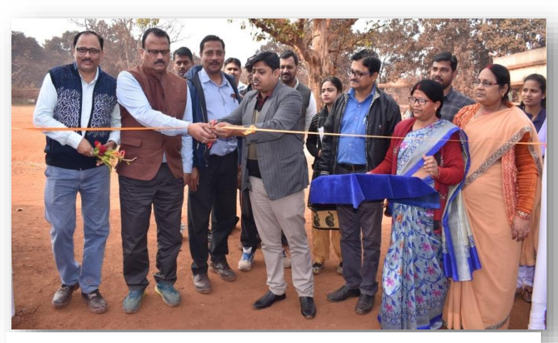
Inauguration of Mega Health Camp at SSVM, Bamebari

Besides these, specialized health camps are organized on time to time basis at different remote tribal villages to make them avail free health diagnosis and treatment.