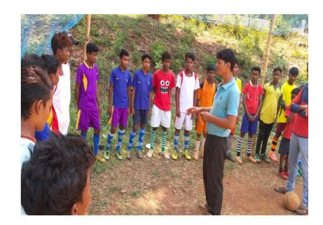
Under-10 Football coaching by expert coach.

We are running Under 10 Football training center at Bamebari, where 13 nos of players are getting trained. Through this initiative we are promoting culture of sports in the younger generation. We are providing platform to the new and young talents to display and hone their skills Under 10 players gets exposure of Inter Unit tournament at Jamshedpur as well as coaching by specialist coach for enhance their sports skill.