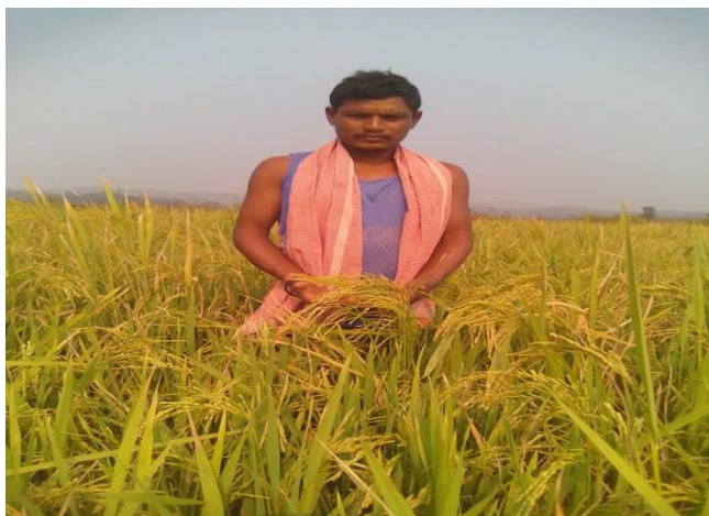
Paddy cultivation through SRI Method at Jagarnathpur

Agriculture generates livelihood not only in direct form but also in indirect form to many landless peasants. As paddy is the only crop raised in many villages of our periphery, we are geared towards supporting the farmers by providing training and technical guidance.