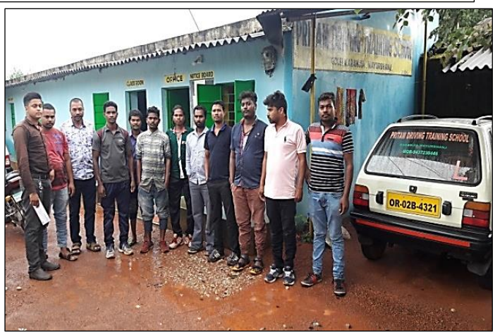
Youths at the Driving Training Institute

One month residential training was provided by the Institute which is affiliated with State Transport Authority, Odisha. It has all basic infrastructures like classroom, Light vehicles, Heavy vehicles and training ground. The Institute gives a 30 days training to the candidates which gets verified by HMV Inspector and further Final Driving License is issued to the successful candidates. A total 8 nos of unemployed youth from operational villages of Khondbondh, FAP and OMQ area were provided training in the 1 <sup>st</sup> batch from 20 <sup>th</sup> Sept'18 to 20 <sup>th</sup> Oct'18. These youths have received a Driving License, Training completion Certificate and Accidental Insurance of Rs. 1.0 Lakh. 15 nos more youths has already been screened for 2 <sup>nd</sup> batch and expected to start the training from January'19.