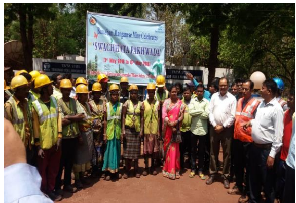
Swachata awareness campaign at public places & villages

Further to motivate communities to adopt sustainable sanitation practices and facilities through awareness creation and health education. Nukad natak on Swachhta, Dengue and malaria was played at various locations of mines site, schools & villages. Further people are counselled in small groups to adopt hygiene practices like hand wash and open defecation we are also doing anti larva fogging in peripheral villages to control mosquito breeding and reduce chances of human health disease.