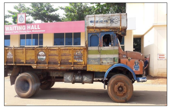
During Practice Session at the Ground