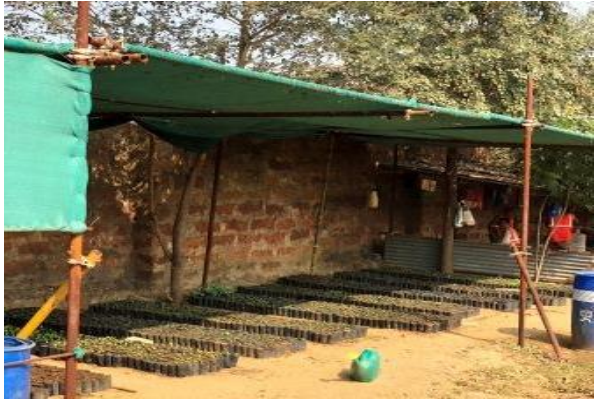
Nursery for Greenery Development