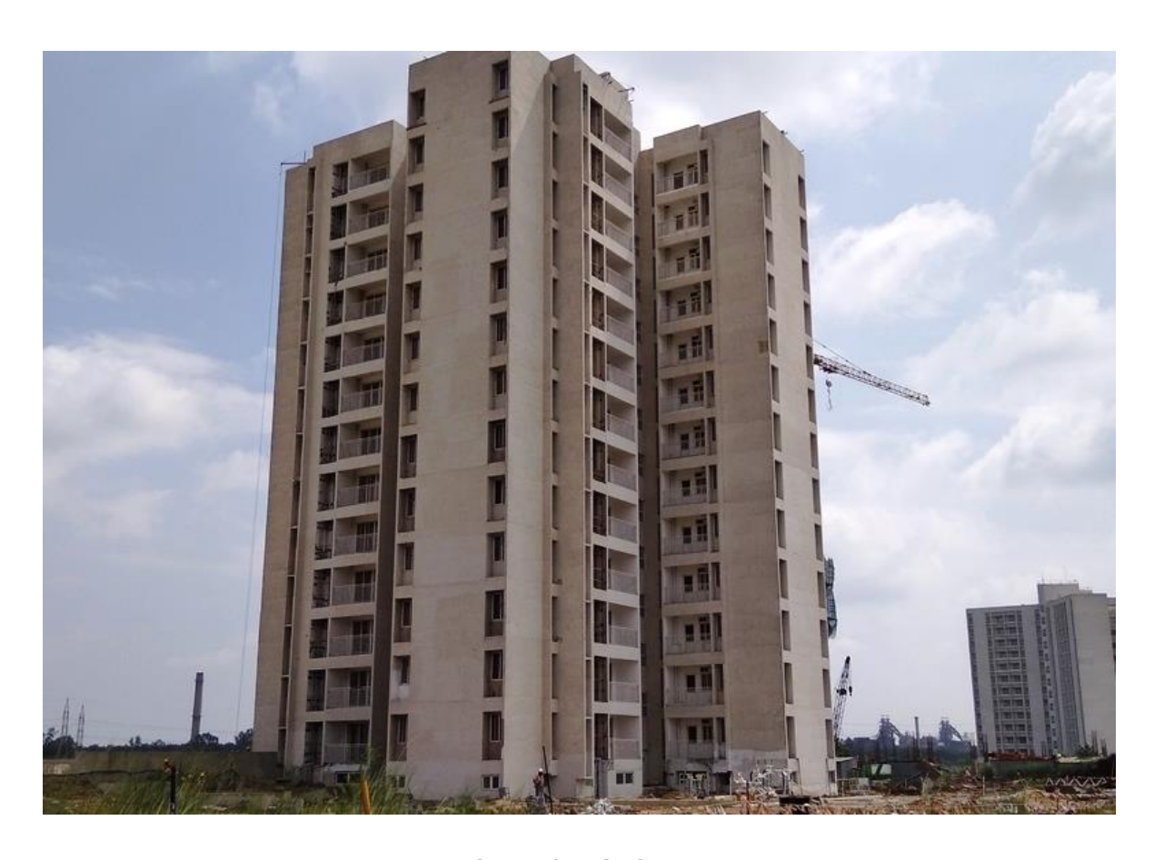
View of building