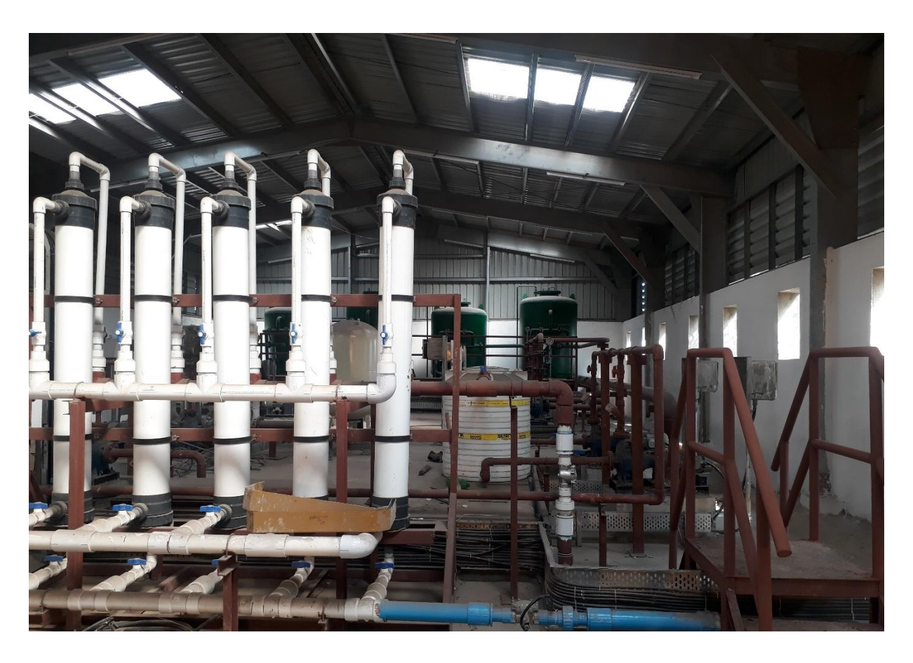
STP (MGF & RO)