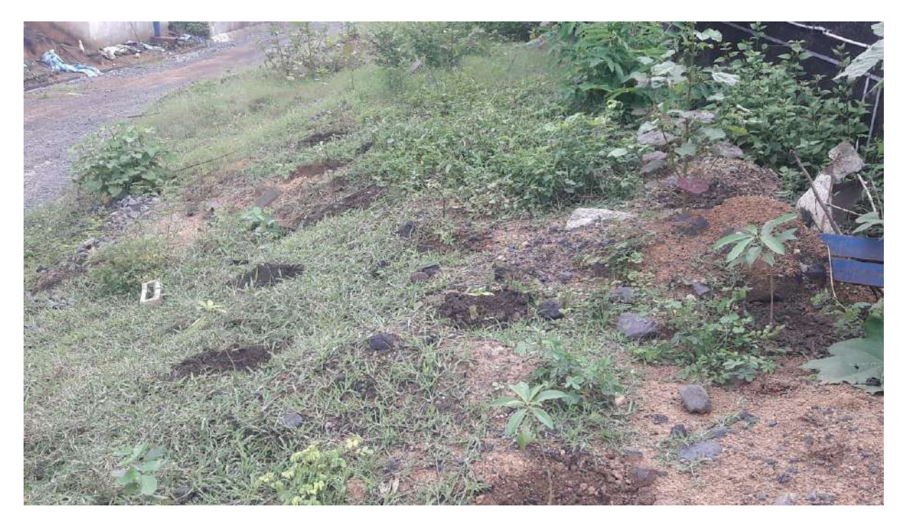
Picture: Plantation around some patches of the boundary wall of washery (JCPP) during this monsoon season.