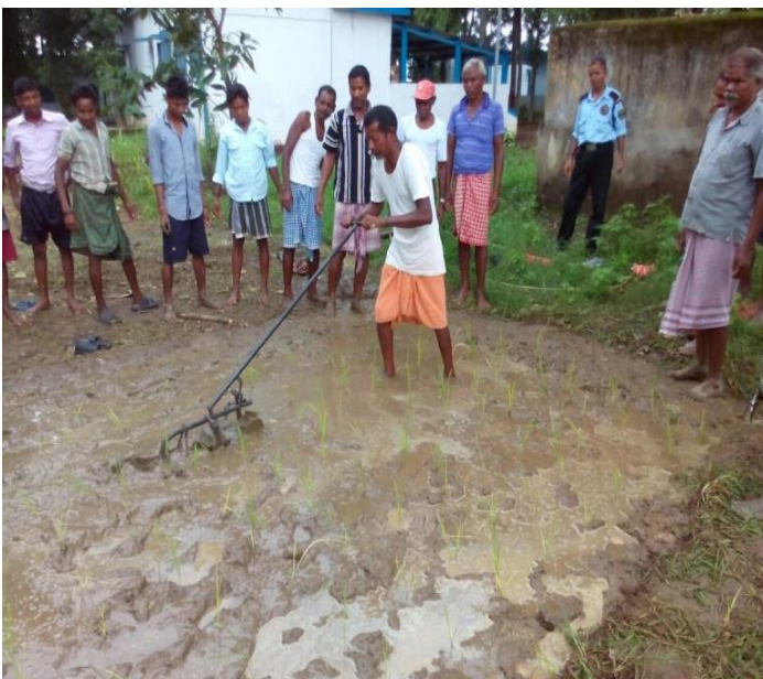
SRI Training at Green Collage Colabera (Jamshedpur)

Paddy is the only crop produced in many villages of our periphery. We are promoting skill development of farmers through advance training in Green Collage colabera, Jamshedpur. This training enhanced capacity building of famers. The main objective of this project is to enhance the agricultural yeild of marginal farmers by improving method of rice cultivation and enhance their capacity through training and exposure. The farmers who got advance training will give field level training to other farmers.