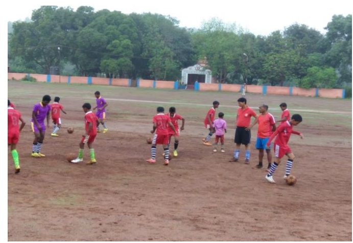
Support of Football Kit to U-10 Football player and coaching by expert Coach

We are running Under 10 Football training centre at Tiringpahar, where 10 nos of players are getting trained. Through this initiative we are promoting culture of sports in the younger generation. We are providing platform to the new & young talents to display and hone their skills.