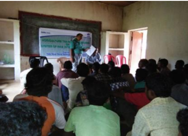
Agriculture Activities (SRI and dryland farming & Village level Training) in Nayagarh Village

Paddy is the only crop produced in many villages of our periphery. We are providing & implementing System of Rice Intensification (SRI). The entire project cost Rs. 40,000 .In FY' 17-18 we worked with 119 farmers in 107 acres of land in Nayagarh, Brahmnidih & Kotpalli Village. The main objective of this project is to enhance the agricultural yield of marginal farmers by improving method of rice cultivation and enhance their capacity through training and exposure. The field level training of farmers and farm visit were organised with support of District Agriculture Department. Field levels helped farmers by giving greater insights of SRI cultivation.