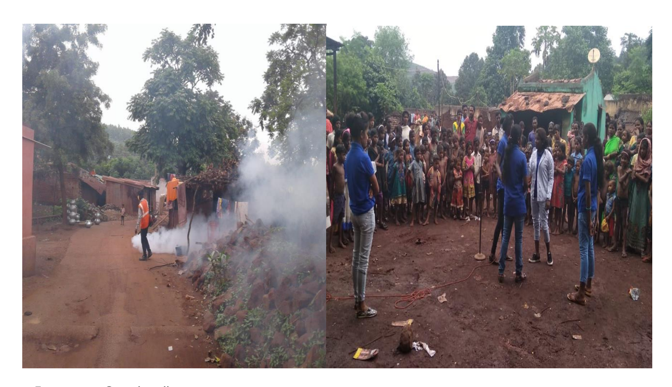
Fogging at Guruda village

Further to motivate communities to adopt sustainable sanitation practices and facilities through awareness creation and health education. Nukad natak on Swachhta, Dengue and malaria was played at various location of mines site, schools & villages. Further people are counselled in small groups to adopt hygiene practices like hand wash and open defecation. We are also doing anti larva fogging in peripheral villages to control mosquito breeding and reduce chances of human health disease.