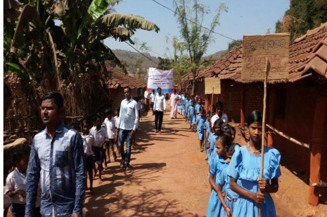
Swachata awareness campaign at School, public places & villages

Further to motivate communities to adopt sustainable sanitation practices and facilities through awareness creation and health education. Nukad natak on Swachhta, Dengue and malaria was played at various location of mines site, schools & villages. Further people are counselled in small groups to adopt hygiene practices like hand wash and open defecation. We are also doing anti larva fogging in peripheral villages to control mosquito breeding and reduce chances of human health disease.