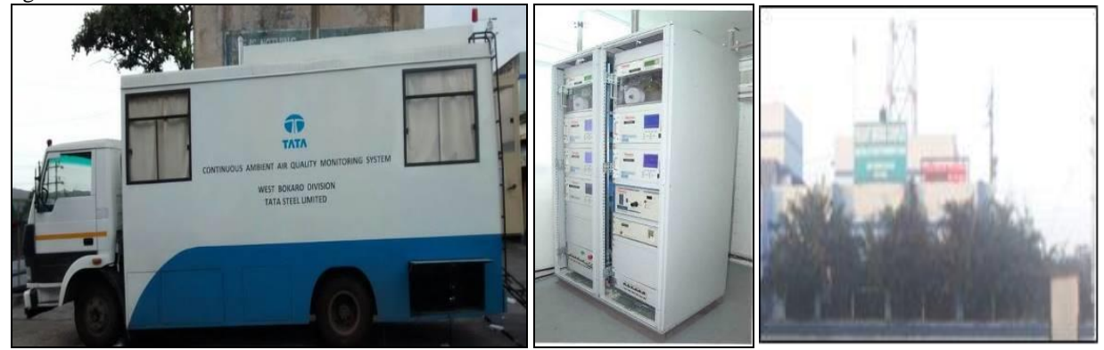
Continuous Ambient Air Quality machine (CAAQMS) for data monitoring system

are recorded on every 15 minutes interval, all parameters were measured by analyzers equipped in mobile van. A displayed unit is also, installed at main entrance of division. All the instruments including mobile van is supplied by CPCB authorized agency & approved from USEPA. The data connectivity with CPCB server & transmission facility is being installed.