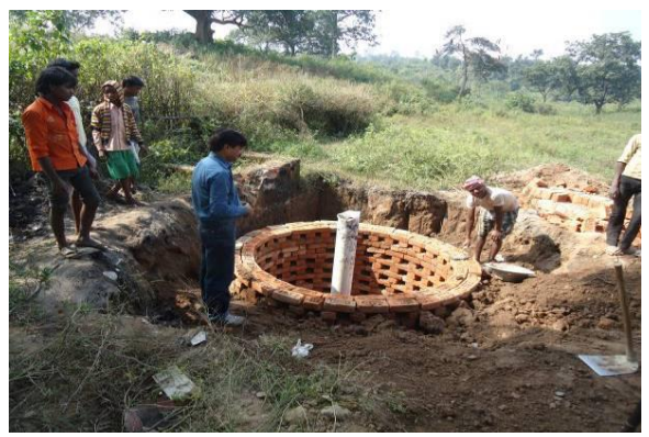
Artificial ground water recharge pit (Bore well) in Birlor village