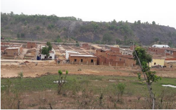
R & R facility provided in the area

(xix) For monitoring land use pattern and for post mining land use, a time series of land use maps, based on satellite imagery (on a scale of 1: 5000) of the core zone and buffer zone, from the start of the project until end of mine life shall be prepared once in 3 years (for any one particular season which is consistent in the time series), and the report submitted to MoEF and its Regional office at Bhubaneswar.