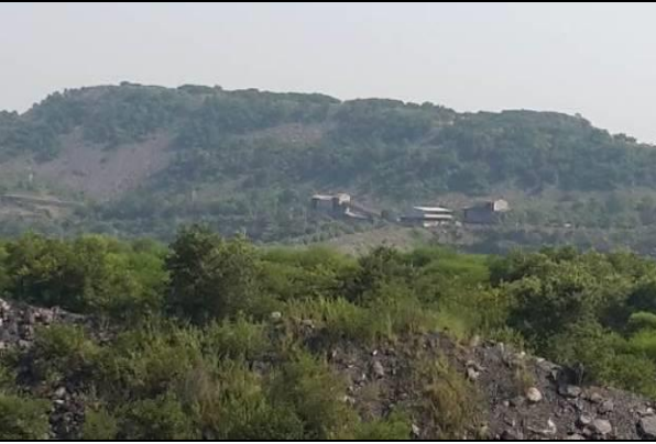
Plantation in OB dump