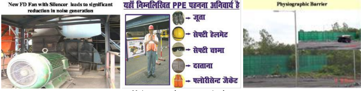
Noise control measures in the area

Control measures are being taken up to keep noise level well within limit in working environment by providing adequate enclosure/ separation to the various high noise sources, proper maintenance, provision of control room, operator's a/c cabin etc. In addition all the persons are provided with PPEs such as ear plug/ muff during work. Warning signs in local language are also displayed at various areas in mines & plant. An adequate green belt is also maintained in the area.