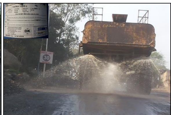
Fixed and mobile water suppression system

(v) Data on ambient air quality (SPM, RPM, SO2 and NOx) should be regularly submitted to the Ministry including its Regional Office at Bhubneshwar and to the State Pollution Control Board and to the Central Pollution Control Board once in six months.