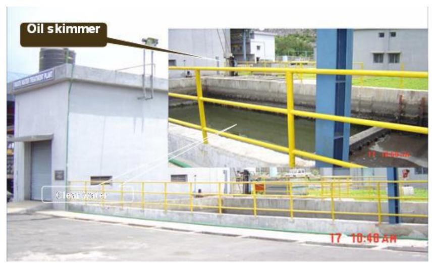
Oil trap in mines

The Industrial wastewaters generated from various operations are handled through effluent management system provided in all operational dept. with the objective to treat the effluent and recycle the clear water. The HEMM maintenance shops have been provided with oil trap arrangement to recover the oil during washing of equipments. The recovered used oil during washing is sold to authorized recycler as per guideline and the effluent generated is checked for quality and recycled -reused in the system.