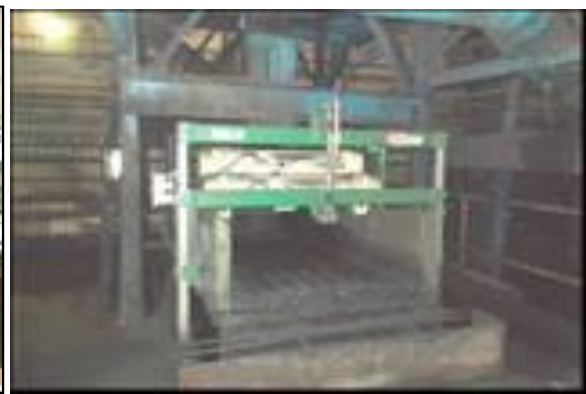
Mechanical tailings de-watering system