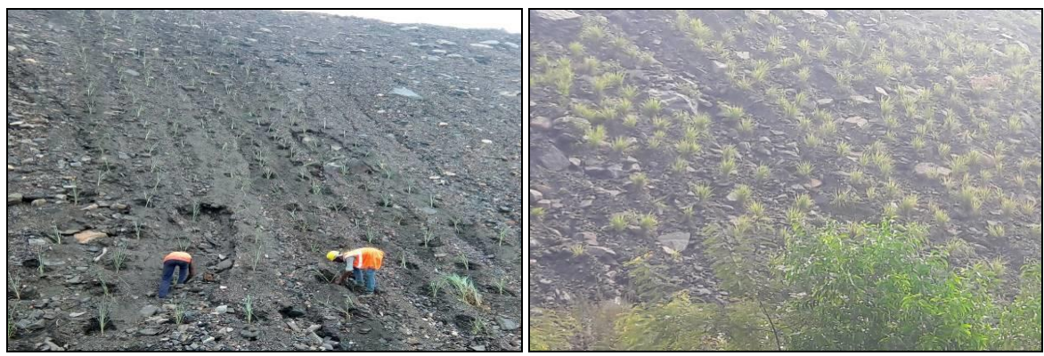
Lemon grass in the dump

One of the out pit dump area is taken up for lemon grass plantation for stabilization.