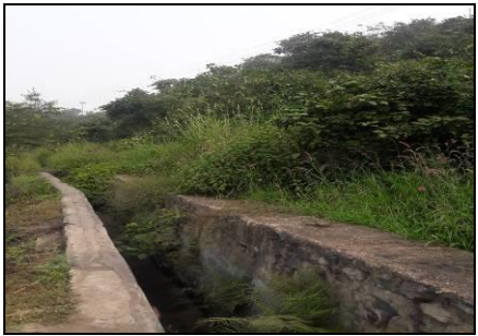
Toe wall & garland drain in the area

(vii) Crushers at the CHP should be operated with high efficiency bag filters, water sprinkling system should be provided to check fugitive emissions from crushing operations, conveyor system, haulage roads, transfer points, etc.