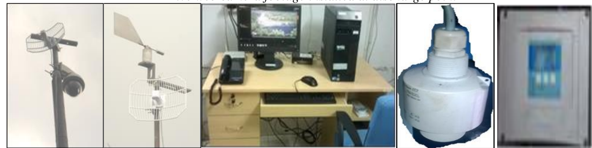
Online Effluent Monitoring System installed at site (Power Plant)

(viii) Vehicular emissions should be kept under control and regularly monitored Vehicles used for transporting the mineral should be covered with tarpaulins and optimally loaded.