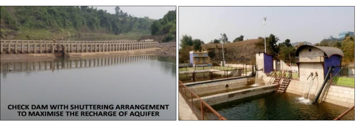
RWH cum drinking water project at Duni village

It is being complied and regularly practiced; no ground water is used for mining & other project activities. All the plants are operated at Zero Liquid Discharge (ZLD) and entire processed water is recycled and reused. An abandoned mine pit is converted into rain water harvesting (RWH) pond. Check dams, rain water harvesting structures are also being constructed in surrounding villages. A separate RWH cum drinking water project is constructed in the area and about 7500 villagers were benefited through pipeline drinking water at doorstep in village.