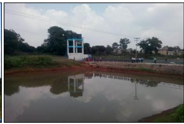
Drinking Water system at Atna village

(xvi) ETP should also be provided for workshop, coal washery and CHP. There shall be zero discharge of wastewater from CHP and the coal washeries. Effluents from the tailings pond shall be treated to conform to prescribed standards in case of discharge into any water course outside the lease.