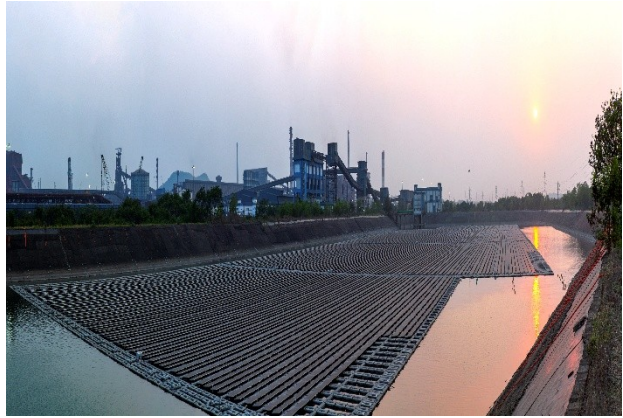
Floating Solar Panel at Water reservoir