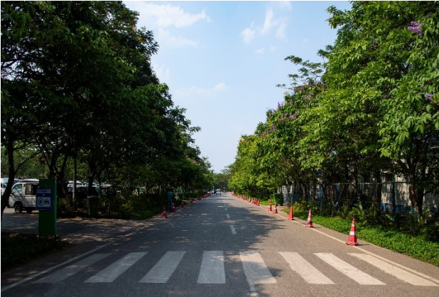
Plantation inside Plant