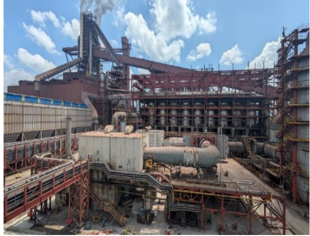
Dry GCP is in Operation