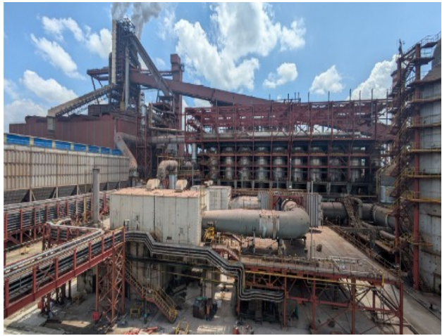
Dry GCP is in Operation