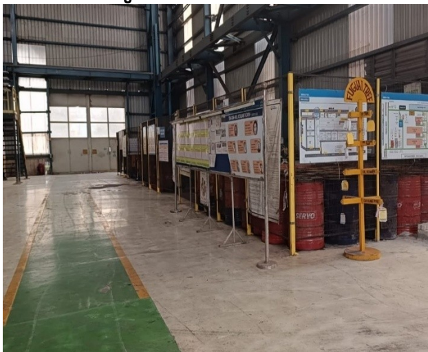
Barrel Storage Shed