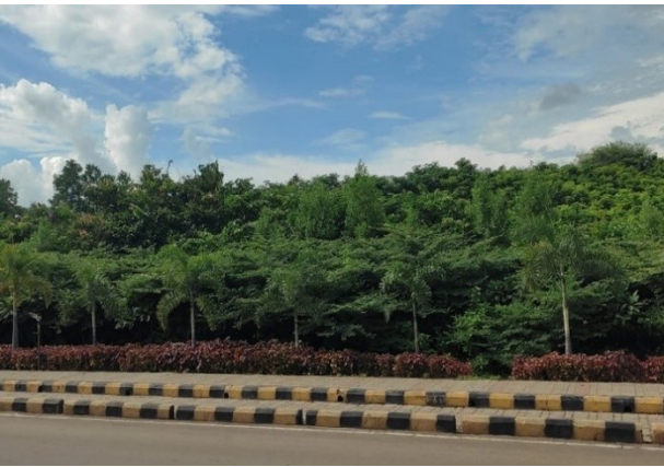
Plantation inside Plant