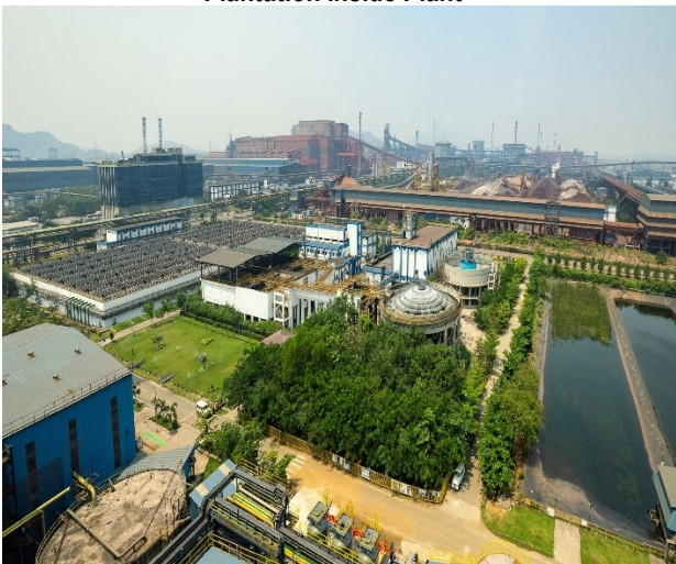
Roof Top Solar panel and Miyawaki Plantation at TWTP