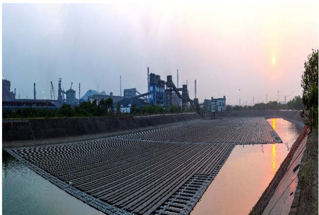
Floating Solar Panel at Water reservoir