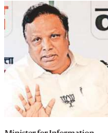
Minister for Information Technology of Maharashtra and Mumbai Guardian Minister Ashish Shelar. File

The fault did not lie with the residents but arose due to loopholes in past regulations or lapses on the part of developers. According to Shelar, "To address this, the Urban Development Department will roll out a new policy from October 2."