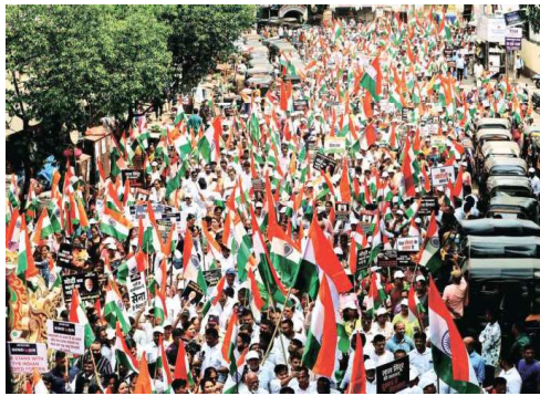
Mahayuti workers take out a Tiranga Yatra in Dombivli on Sunday, in support of Operation Sindoor and the Indian Army. The Yatra started from Ganesh Mandir on Phadke Road and concluded at Chhatrapati Shivaji Maharaj Chowk.

Have a comment or suggestion for Mumbai Confidential? Write to mumbai.newsline@expressindia.com with subject line: Mumbai Confidential