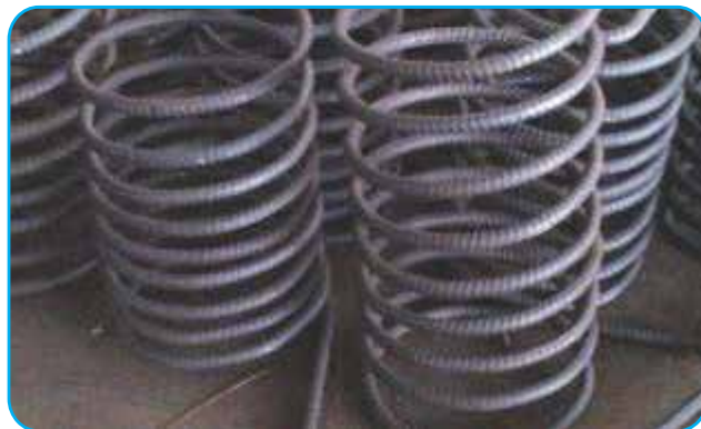
Helical or Spring