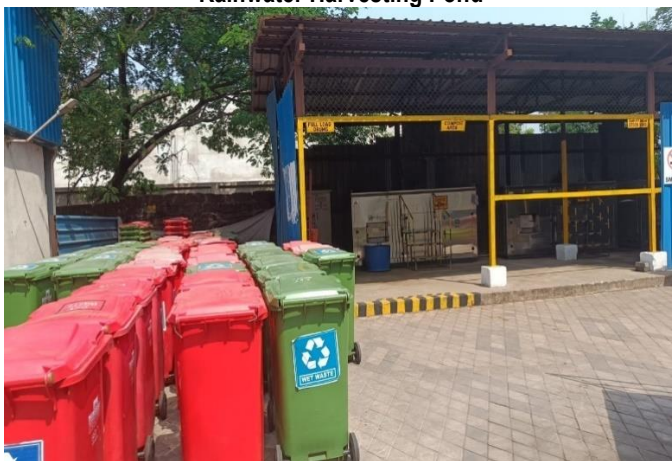
Organic waste composting machines are in operation