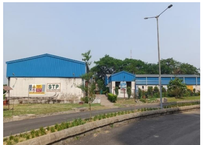
1000 KLD Sewage Treatment plant in operation