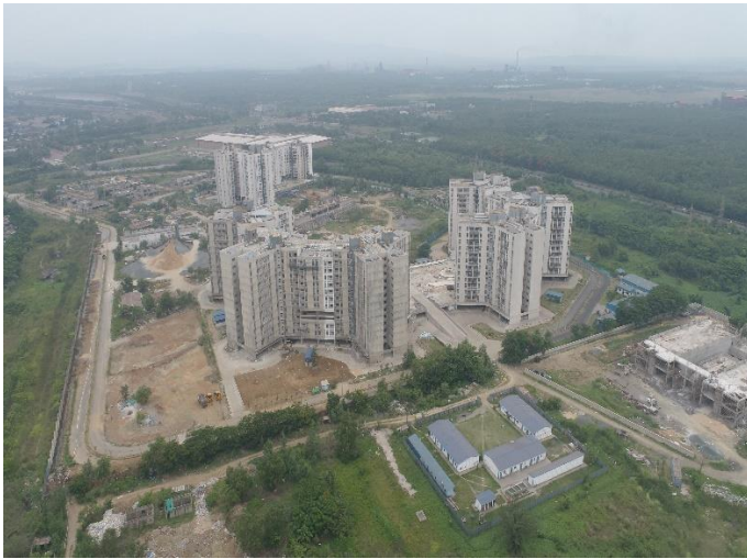
Aerial view of Residential Complex