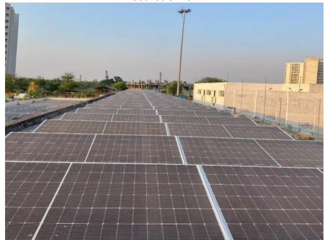
Roof Top Solar Panel