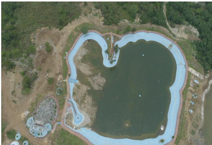
Rainwater Harvesting Pond