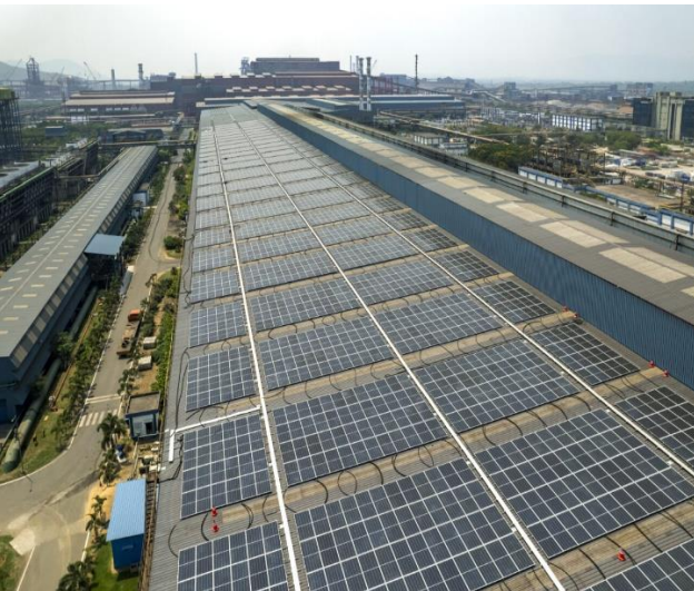
PV Solar Panel installed at HSM Roof top