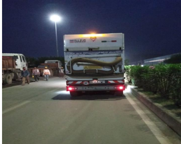
Mechanized road dust sweeping