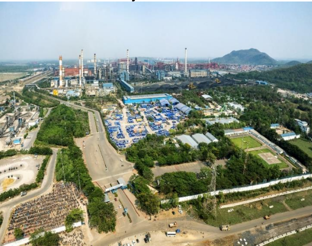
Plantation inside Plant