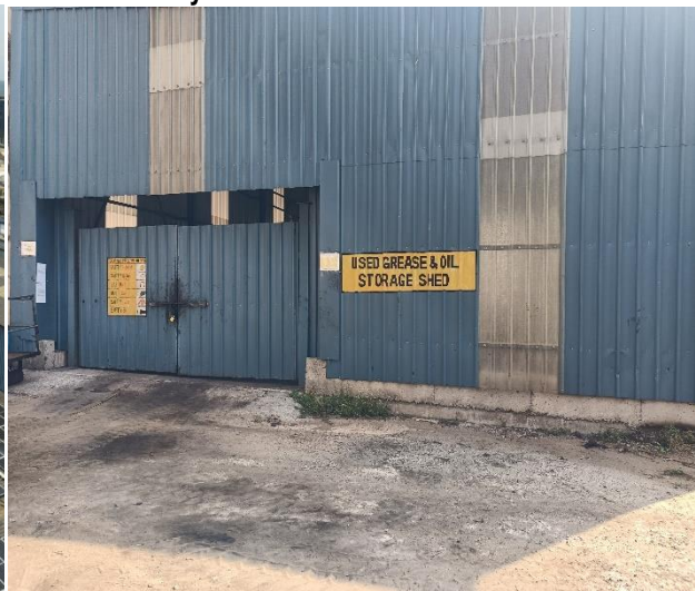
Barrel Storage Shed