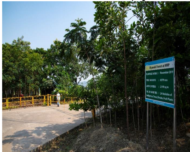
Miyawaki Plantation inside Plant