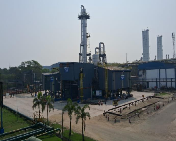
MVR System at CETP