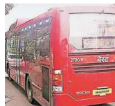
On November 3, employees protested across major depots in Mumbai.

THE BRIHANMUMBAI Electric Supply and Transport (BEST) employees will receive a Diwali bonus of Rs 29,000 each, following an allocation of Rs 80 crore by the Brihanmumbai Municipal Corporation (BMC). The announcement came after a flash strike on November 3 at major depots across Mumbai, where employees protested the delayed bonus payment. In response to the strike, BEST administration officials met with union leaders at the transport body's headquarters in Colaba. According to sources, the BMC committed Rs 80 crore