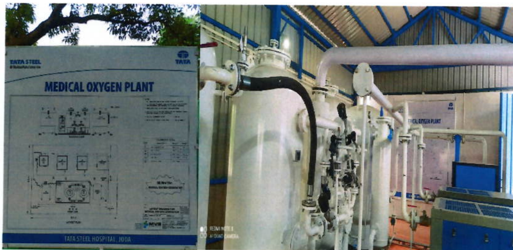
50 Nm 3 / Hr. Medical Oxygen Plant at Tata Steel Hospital, Joda (Sept 2021)