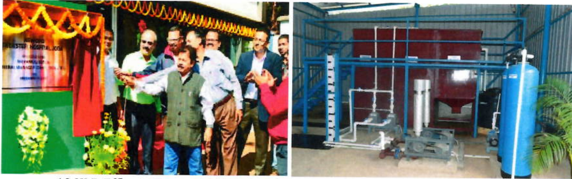
10 KLD Effluent Treatment Plant (ETP) at Tata Steel Hospital Joda (Dec 2017)