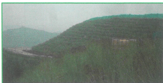
Vetiver Plantation on Dump slope