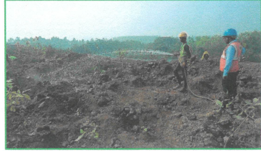
Dump Site Plantation