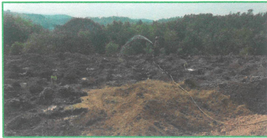
Dump Site Plantation