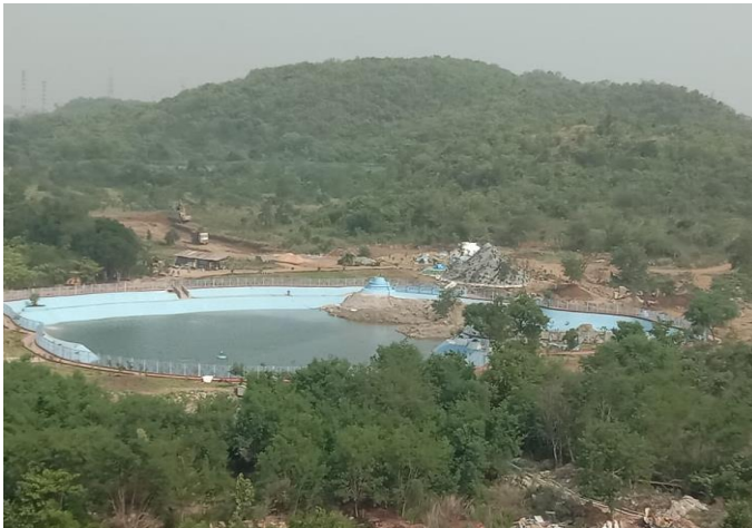
Rainwater Harvesting Pond