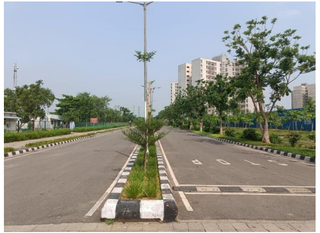
Green Belt view