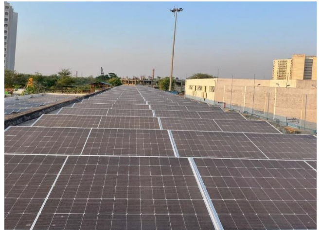
Roof Top Solar Panel installed.