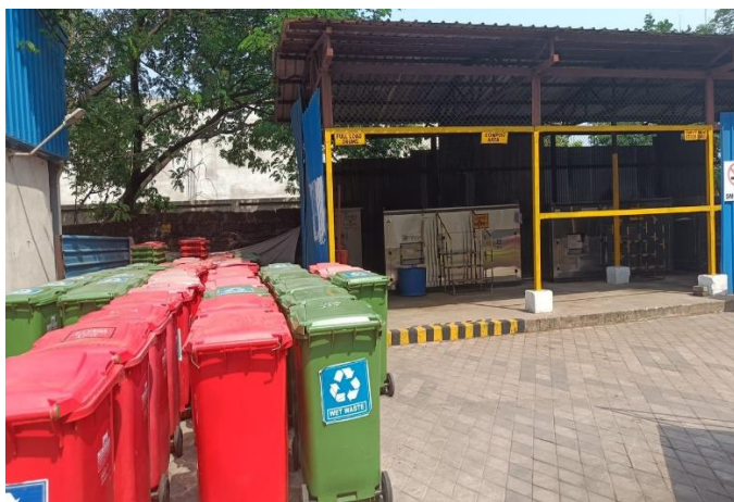
Organic waste composting machines are in operation