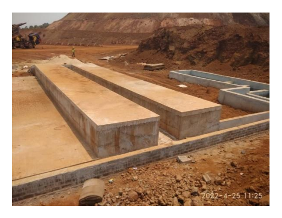
Vehicle washing with Oil & Grease separation pit