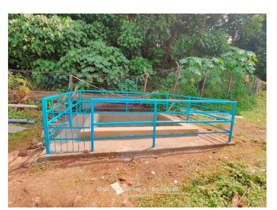
Roof top Rainwater Harvesting Structures