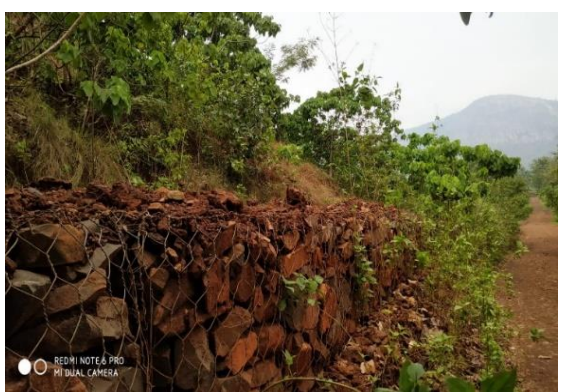
Waste dump management with Retaining wall and Garland drain construction