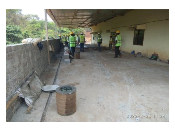
Hazardous storage area