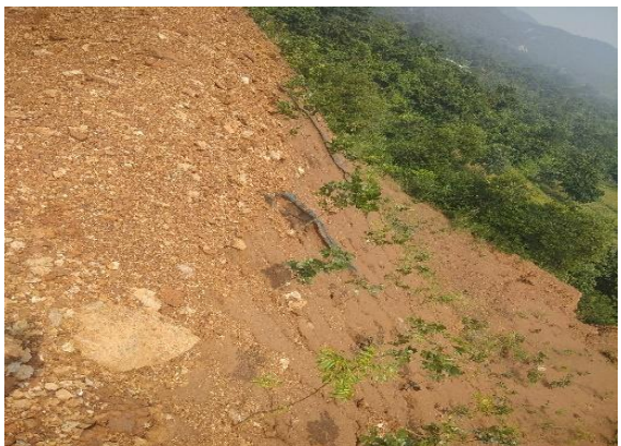
Waste dump plantation in FY 2022-23