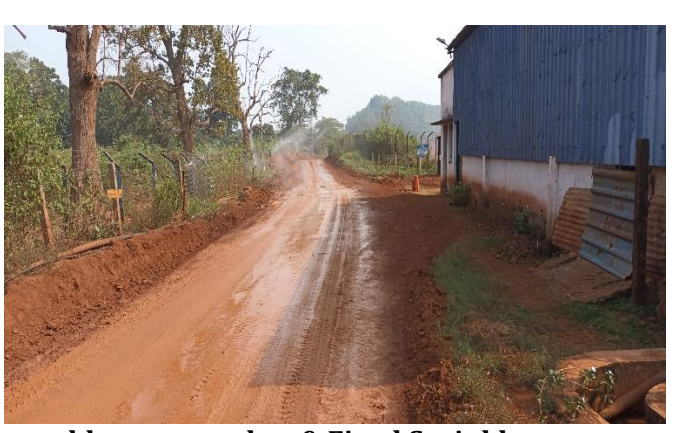
Water sprinkling through movable water tanker & Fixed Sprinkler