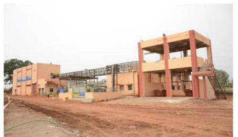
Oil-Water separation pit