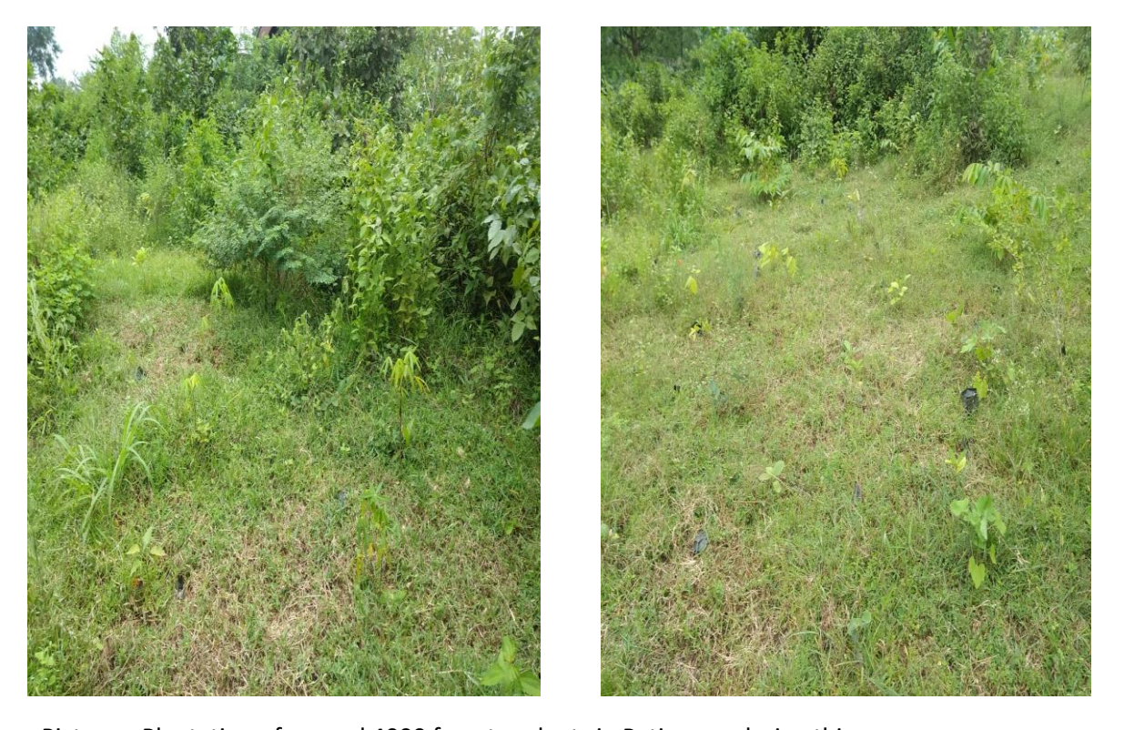
Pictures: Plantation of around 4000 forestry plants in Patia area during this monsoon season.