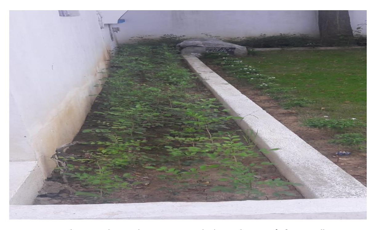
Picture: Plantation done in this monsoon inside the creche area of 6&7 pits colliery.