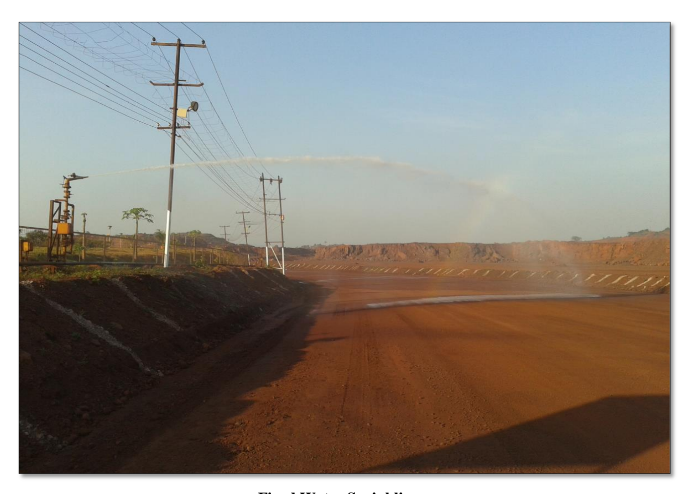
Fixed Water Sprinkling