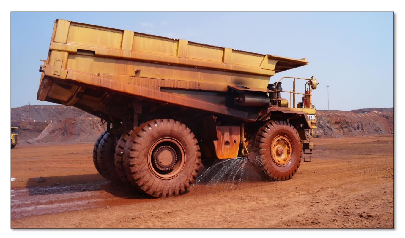
Mobile Water Sprinkling