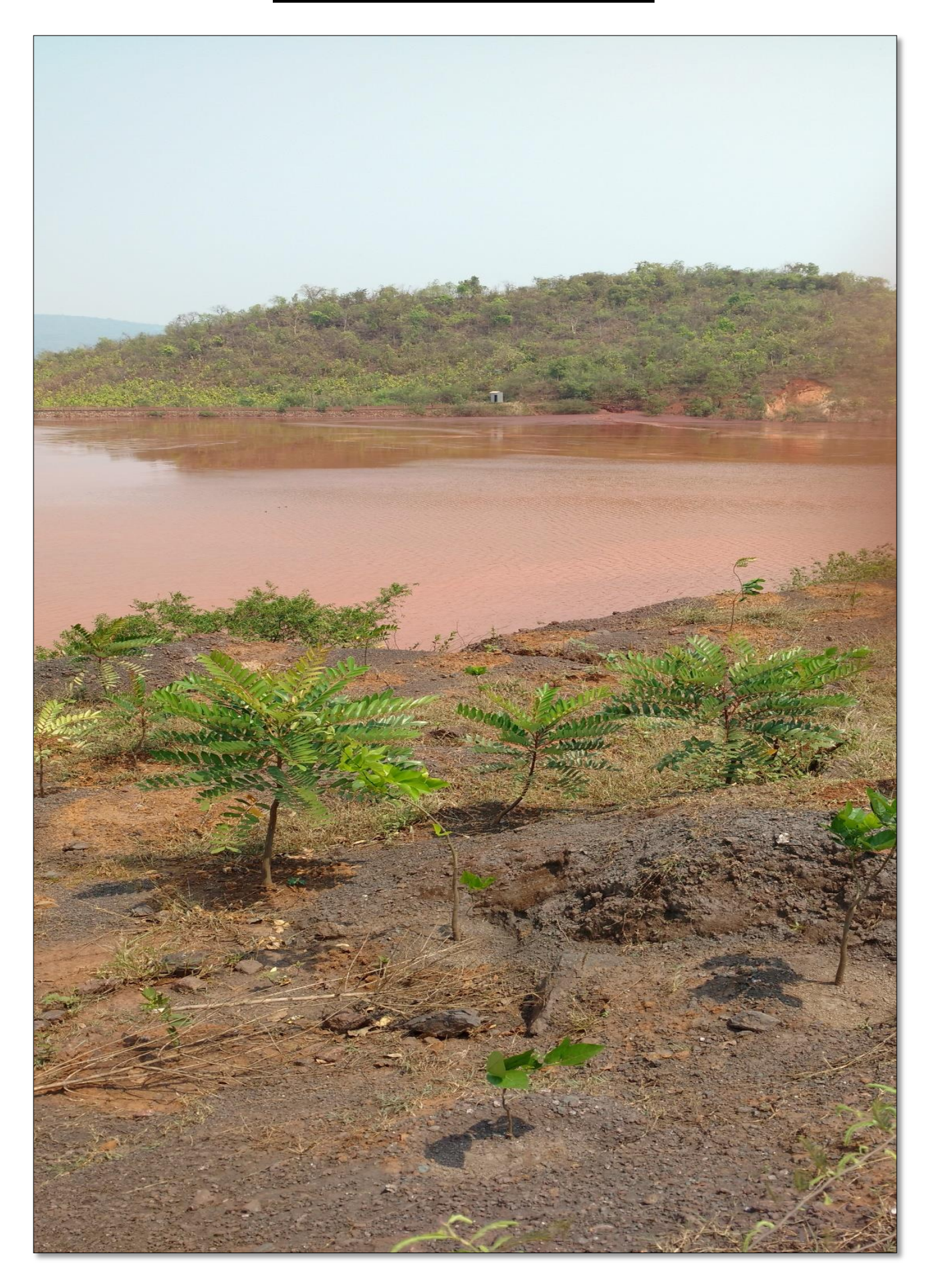
Annexure-III: Zero Discharge Slime Dam