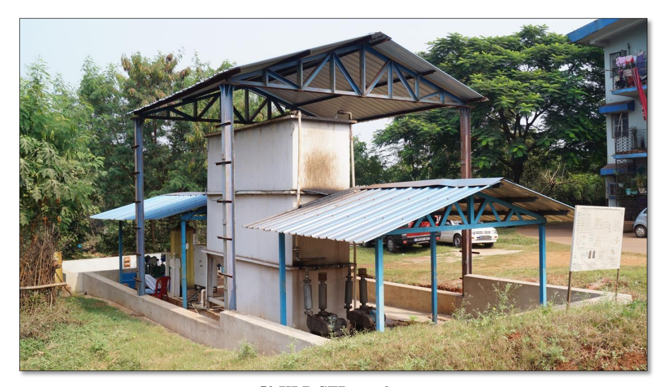
50 KLD STP at colony