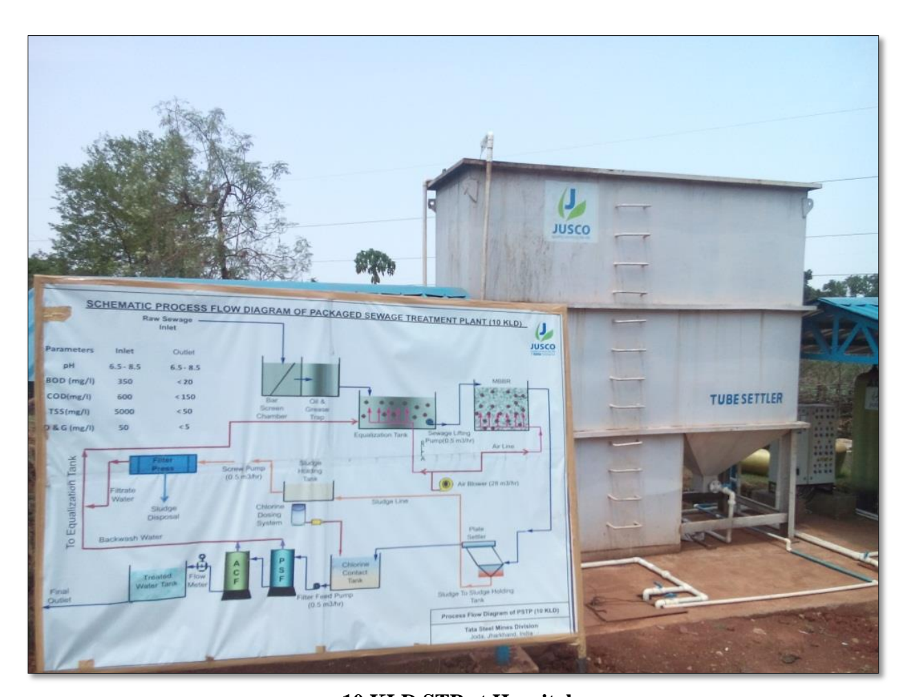
10 KLD STP at Hospital