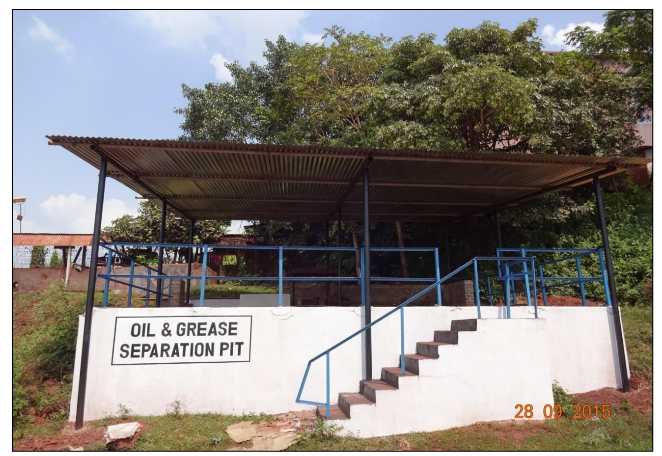
Oil & Grease Separation Pit