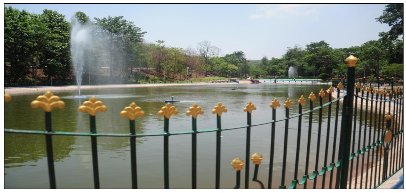
RWH at Central camp