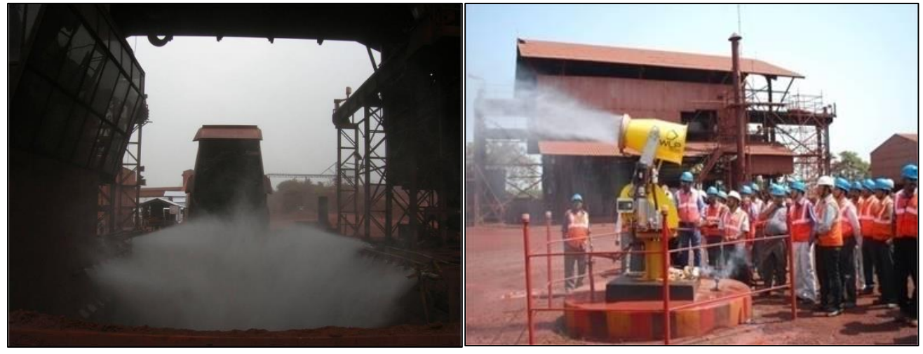
Water Jet System at Unloading Point