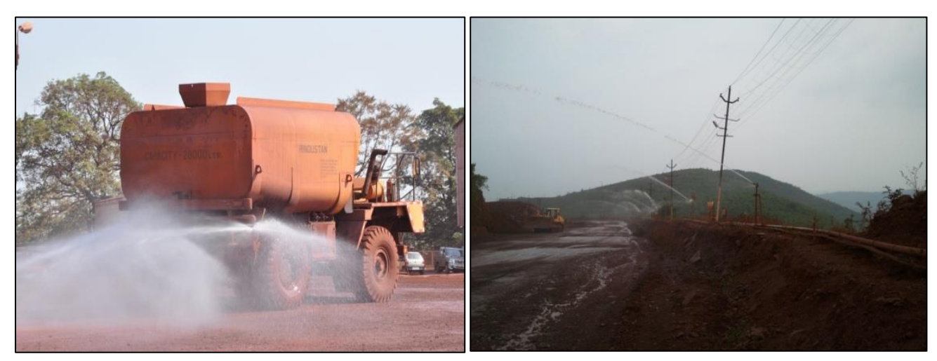
Mobile Water Sprinkler