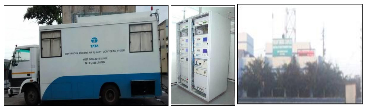
Continuous Ambient Air Quality machine (CAAQMS) for data monitoring system

Environmental monitoring data is attached as an annexure-I & external monitoring report from NABL accredited laboratory is attached as annexure-II.