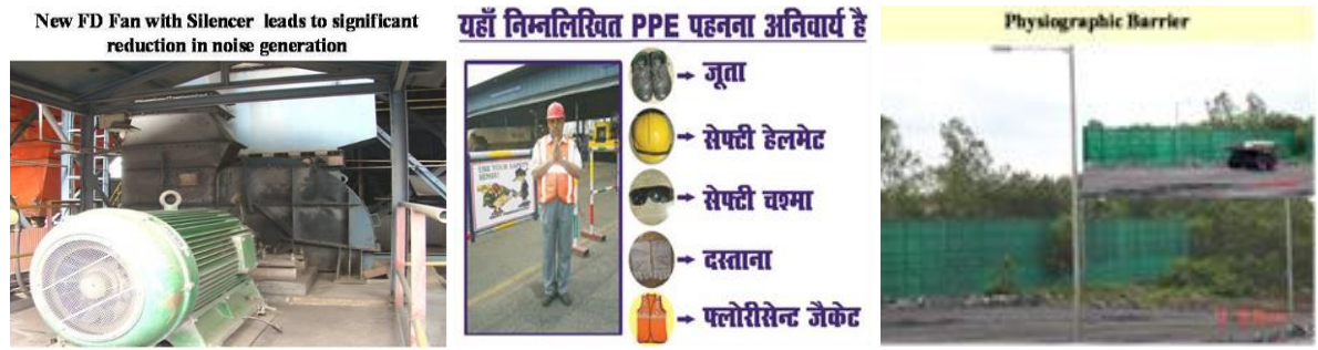
Noise control measures in the area

Control measures are being taken up to keep noise level well within limit in working environment by providing adequate enclosure/ separation to the various high noise sources, proper maintenance, provision of control room, operator's a/c cabin etc. In addition all the persons are provided with PPEs such as ear plug/ muff during work. Warning signs in local language are also displayed at various areas in mines & plant. An adequate green belt is also maintained in the area.