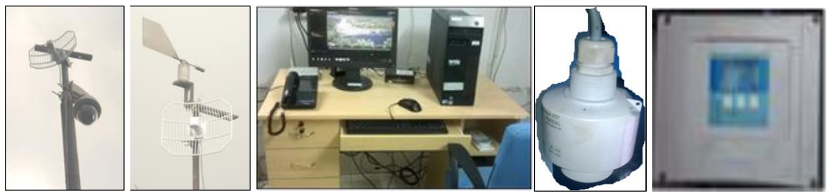
Online Effluent Monitoring System installed at site (Power Plant)

(viii) Vehicular emissions should be kept under control and regularly monitored Vehicles used for transporting the mineral should be covered with tarpaulins and optimally loaded.