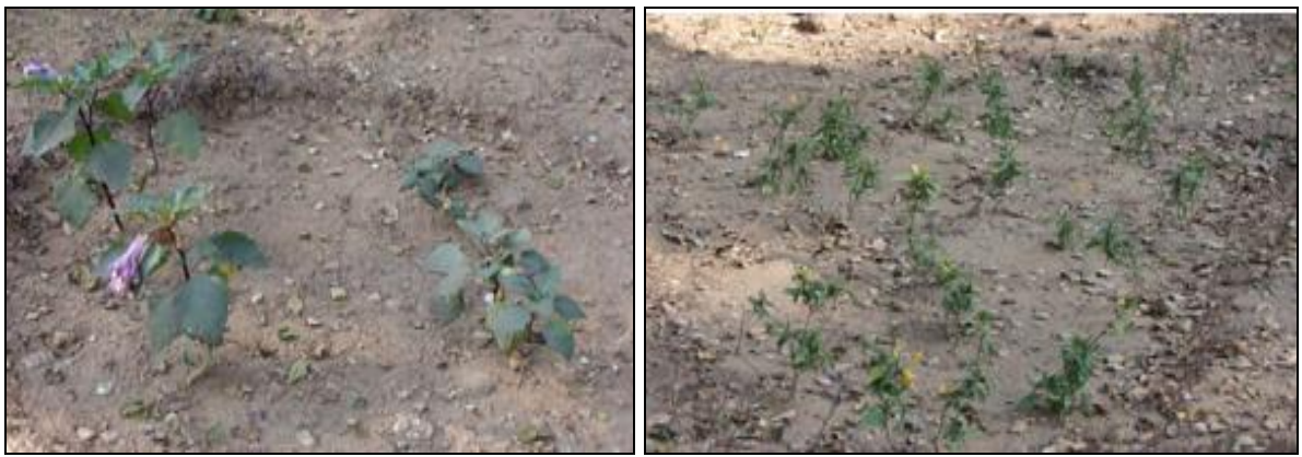
Datura (Datura stramonium)

The project area doesn't have any endangered species found in and around area. However, some of the plants of having medicinal values are conserved by developing an area. Separate fund has been earmarked for implementation of conservation plan along with State Forest and Wildlife Department (if any). Some of the species of medicinal importance are as: