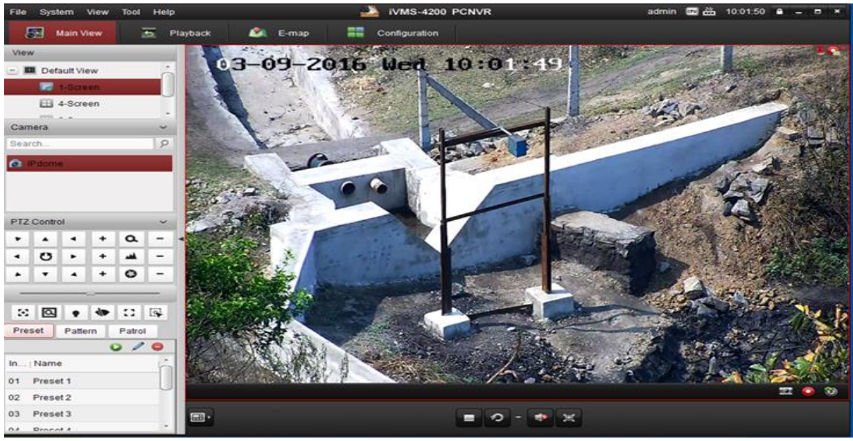
Live web camera footage installed at discharge point

Zero Effluent Discharge (ZLD) being maintained at all units including captive power plant (2x10MW FBC). A web camera (ip: 117.244.160.6) along with flow meter is installed at discharge end and all data being regularly submitted to state pollution control board.