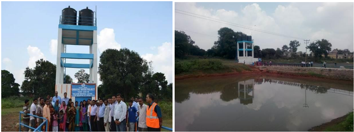
Drinking Water system at Atna village

(xvi) ETP should also be provided for workshop, coal washery and CHP. There shall be zero discharge of wastewater from CHP and the coal washeries. Effluents from the tailings pond shall be treated to conform to prescribed standards in case of discharge into any water course outside the lease.