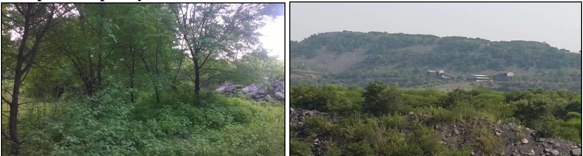
Plantation in OB dump

No further new external OB dumps will be created for storing of OB. Since the mined out area in the operating mines are available which is being used for inpit dumping. The existing reclaimed dump site is being monitored & maintained to sustain vegetation. All the external OB dumps have stabilized over the years and more over, retaining wall has also been provided for further stability. Abandoned dump area has been identified and taken up for reclamation. As per modified mine plan, all existing dump are temporary and will be re-handled as mine advances.