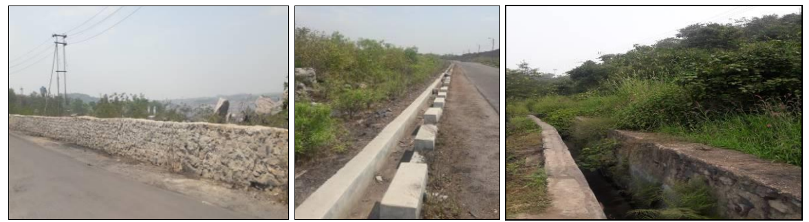
Toe wall & garland drain in the area

Complied with. All the dumps are covered with toe wall and garland drains. All the drains are regularly being maintained for silt removal.