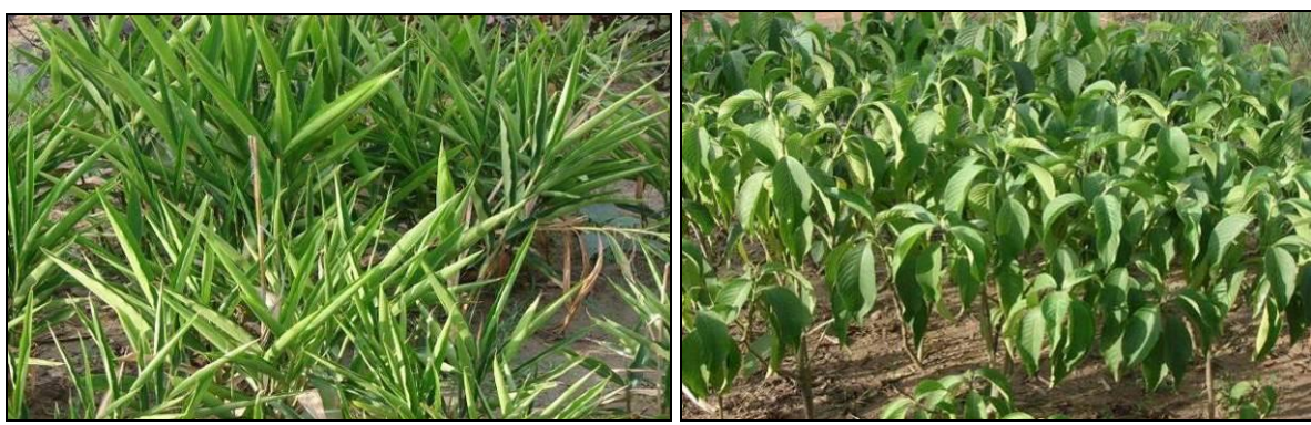
Ginger (Zingiber officinalis)

Coleus aromaticus (Plectranthus amboinicus)