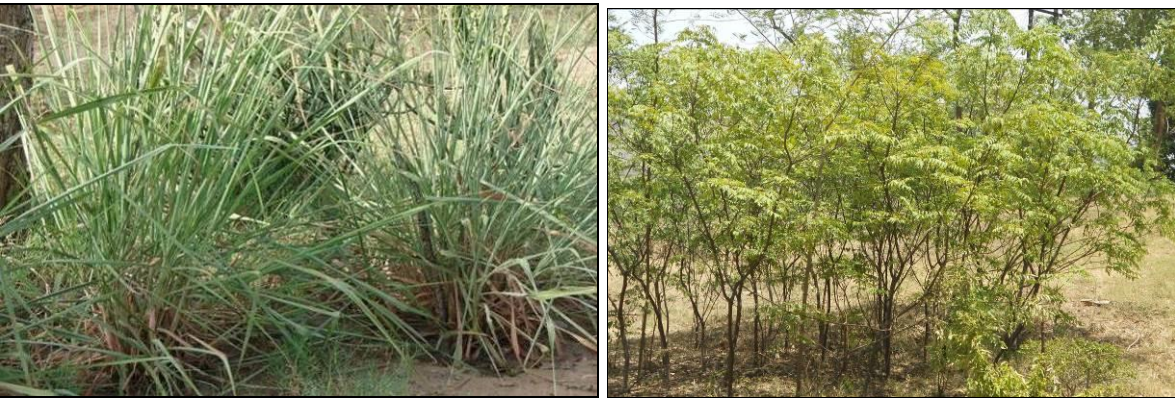
Lemongrass (Cymbopogon citratus)