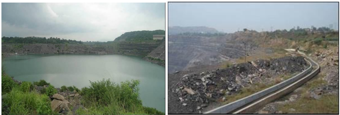
Abandoned mine pit as RWH pond

To arrest the silt and sediment flow from soil, catch drains silt ponds were constructed in the dump area. The water collected in siltation pond is reused in gardening and dust suppression in mines area. Construction of garland drain is a regular practice to take care of run-off water in the mining operation. The details of garland drain are top width varies in between 6m to 10m & bottom width is kept at 3m. Depth varies from 2m to 7m. The sump capacity is in order of 48-120 million gallons considering maximum rainfall depending upon the catchment area. Accumulated mine pit water being used in industrial and domestic purpose after necessary treatment. One of the de coaled area of Query E site is being used as rain water, catchment water storage area.