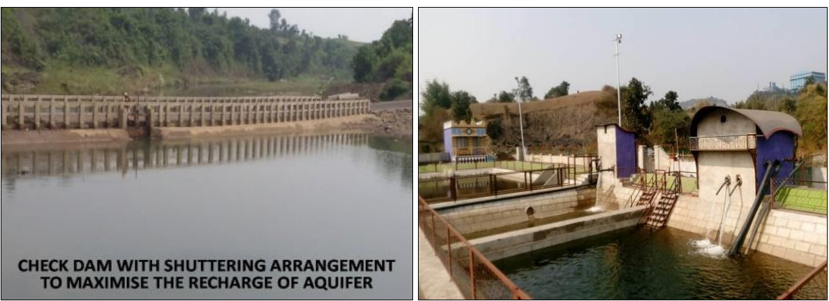
RWH cum drinking water project at Duni village

water project is constructed in the area and about 7500 villagers were benefited through pipeline drinking water at doorstep in village.