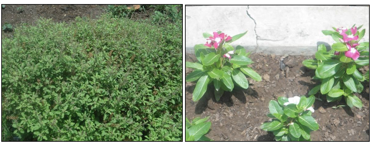
Tulsi (Ocimum scantum)