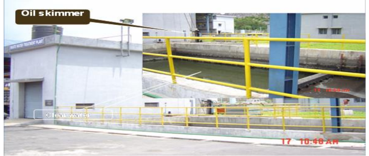
Oil trap in mines

The Industrial wastewaters generated from various operations are handled through effluent management system provided in all operational dept. with the objective to treat the effluent and recycle the clear water. The HEMM maintenance shops have been provided with oil trap arrangement to recover the oil during washing of equipments. The recovered used oil during washing is sold to authorized recycler as per guideline and the effluent generated is checked for quality and recycled -reused in the system.