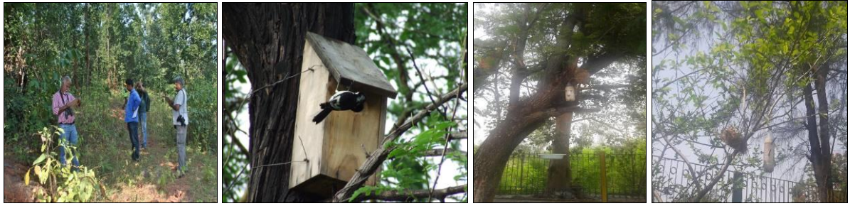
Biodiversity study & initiatives

(xi) A Progressive Closure Plan shall be implemented by reclamation of quarry area of 974 ha which shall be backfilled and afforested by planting native plant species in consultation with the local DFO/ Agriculture Department. The density of the trees should be around 2500 plants per ha. The balance 20 ha of de coaled area being converted into a water reservoir shall gently slope along the upper benches and stabilized and reclaimed with plantation.