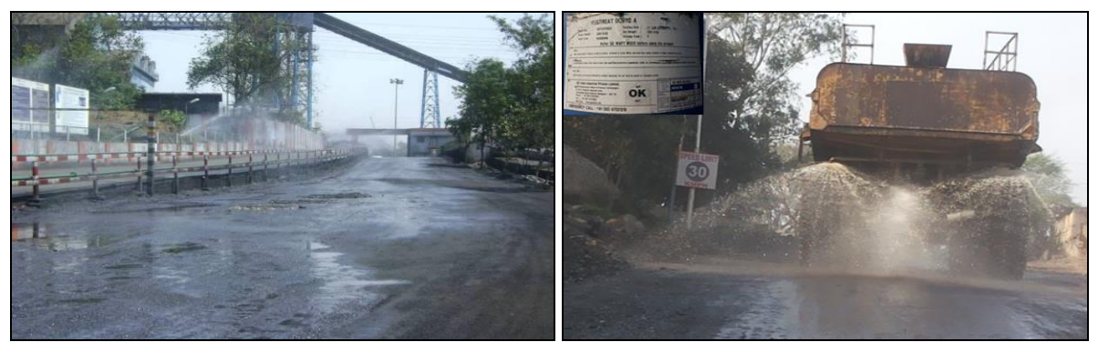
Fixed and mobile water suppression system

All the strategic locations of operating plants where the possibilities of fugitive dust emissions, has been provided with adequate enclosures, side skirt, chute, seal plate, sealing of transfer points along with adequate dust suppression system. All the sites are monitored regularly (once in a month) and data is kept for record. The haul road, loading and unloading points are provided with pressurized water tanker for water spraying along with chemical dosing, wagon loading does not require any water spraying since the coal is in moist condition.