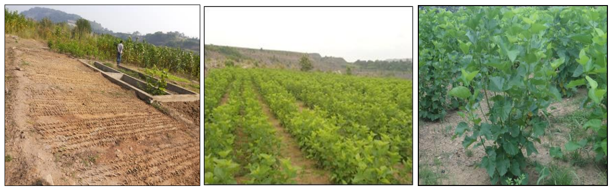
Plantation of mulberry in dump for stabilization & reclamation

(xii) A Conservation Plan for endangered species found in and around the project area shall be formulated and for the medicinal plants (in-situ and ex-situ) shall be prepared and implemented in consultation with the State Forest and Wildlife Departments. Separate funds shall be earmarked for implementation of the various activities there under and the status thereof shall be regularly reported to this Ministry and the MoEF Regional Office, Bhubaneswar.