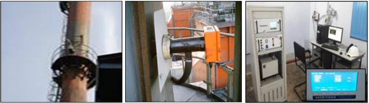
Continuous Emission Monitoring for Power House for PM, Sox & NOx data

Online emission monitoring for FBC based 2x10MW captive power plant is installed at for PM, SO<sub>2</sub> & NOx monitoring in stack and continuously being transmitted to JSPCB server. Electro Static Precipitator (ESP) is attached with the power plant and is regularly being maintained. The quality & quantity of emission is maintained well within limit as per standard. The approval for data connectivity permission to CPCB is recently granted to vendor. All the data of PM, SOx & NOx are working smoothly.