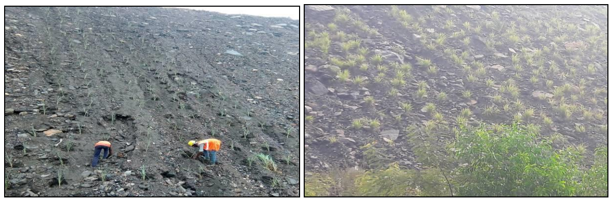
Lemon grass in the dump

One of the out pit dump area is taken up for lemon grass plantation for stabilization.