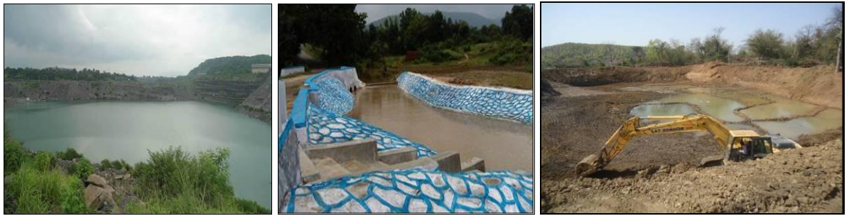
Rainwater harvesting structures

(xiv) Regular monitoring of groundwater level and quality should be carried out by establishing a network of existing wells and construction of new peizometers. The monitoring for quantity should be done four times a year in pre-monsoon (May), monsoon (August), post-monsoon (November) and winter (January) seasons and for quality in May. Data thus collected should be submitted to the Ministry of Environment & Forests and to the Central Pollution Control Board quarterly within one month of monitoring.