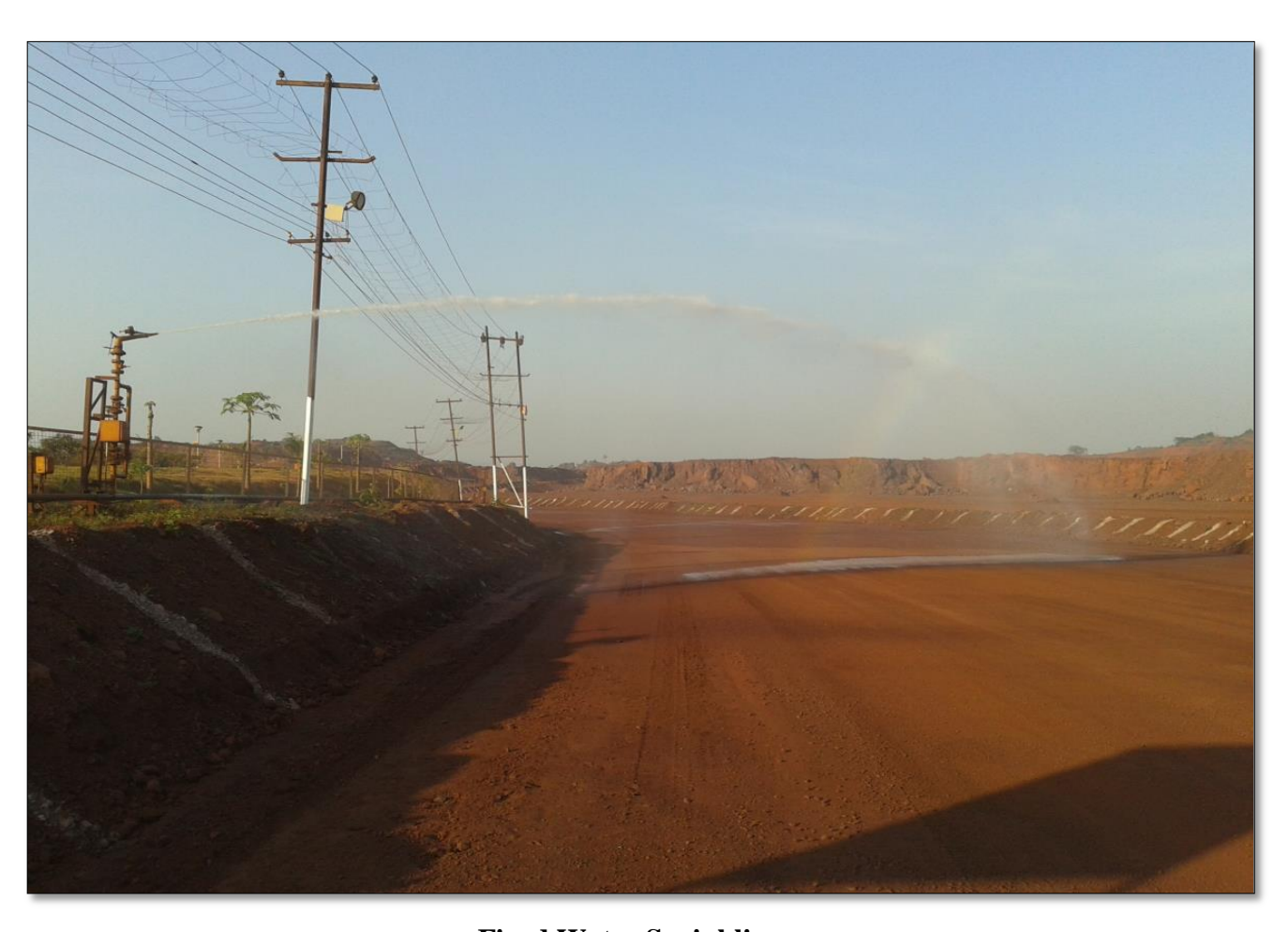
Fixed Water Sprinkling