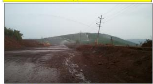
Use of Dry fog system at all transfer points in plants

Use of fixed water sprinklers at haul roads for dust suppression