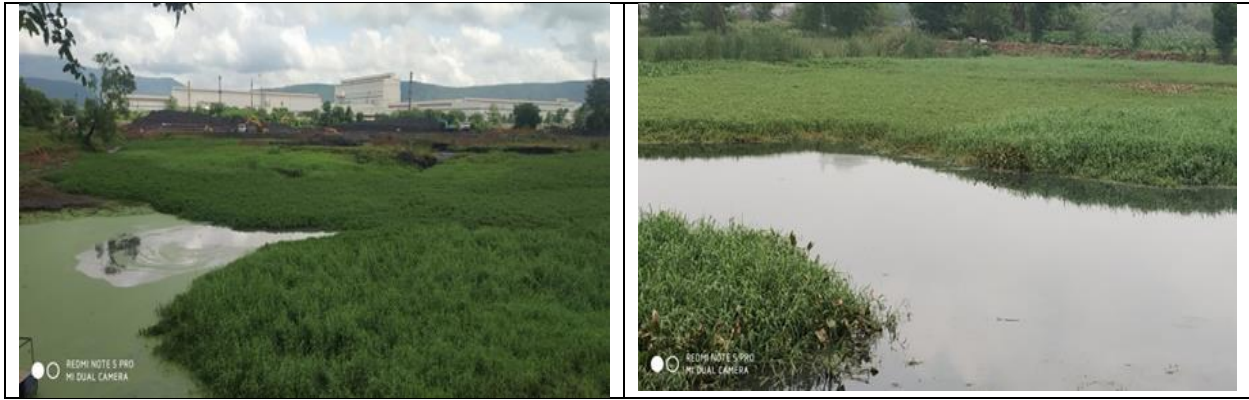
Pre-Project Condition of Ponds

Requirement: There is a need to save and maintain water bodies in the area for rainwater harvesting and to maintain greenery in the periphery and other available spaces by enhancing the plant density and biodiversity. it was proposed to take up projects related to rejuvenation of water bodies at CRM Bara Complex.