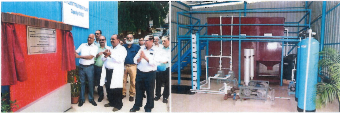
10KLD Effluent Treatment Plant (ETP) at Hospital