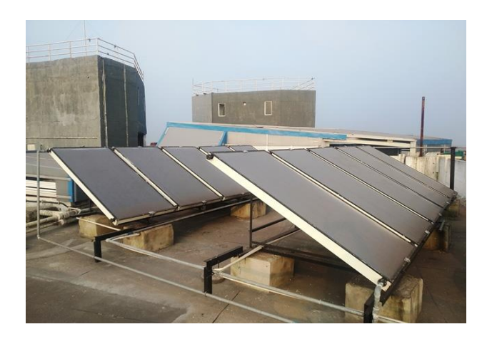
Solar Panel at Roof top