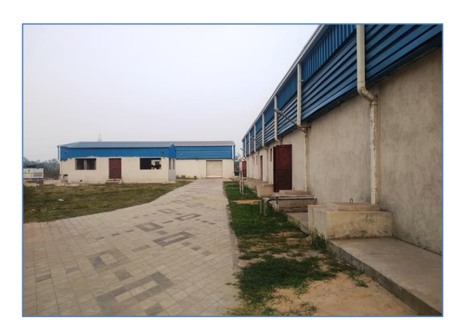
STP at Residential Complex