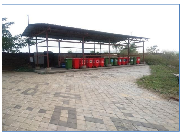
Garbage Segregation System