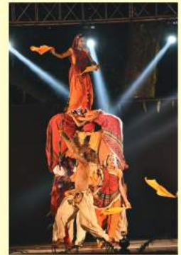
Rathwa tribe of Gujarat