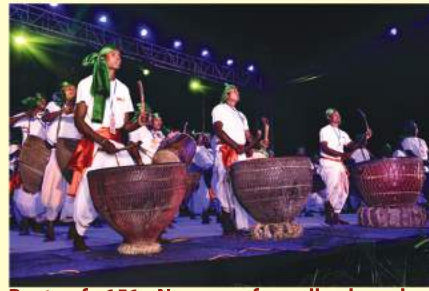
Beat of 151 Nagaras formally launched Samvaad 2016