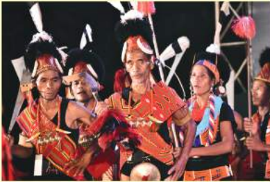
Konyak Tribe of Nagaland