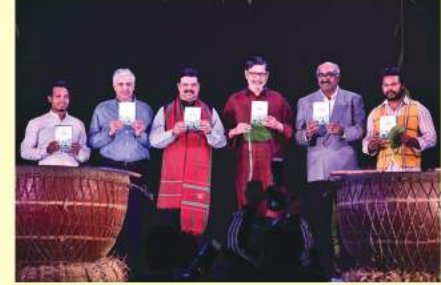
Launch of Ho music album