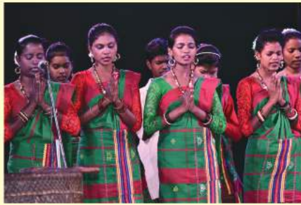
Banam group of Tribal Cultural Society