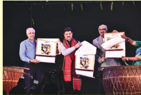
Unveiling of the tribal calendar