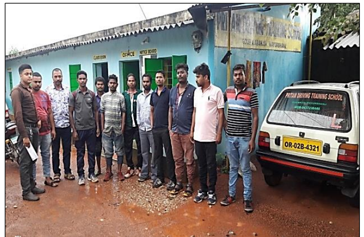
Youths at the Driving Training Institute

One month residential training was provided by the Institute which is affiliated with State Transport Authority, Odisha. It has all basic infrastructures like classroom, Light vehicles, Heavy vehicles and training ground. The Institute gives a 30 days training to the candidates which gets verified by HMV Inspector and further Final Driving License is issued to the successful candidates. A total 8 nos of unemployed youth from operational villages of Khondbondh, FAP and OMQ area were provided training in the 1 st batch from 20 th Sept'18 to 20 th Oct'18 . These youths have received a Driving License, Training completion Certificate and Accidental Insurance of Rs. 1.0 Lakh. 15 nos more youths have already been screened for 2 nd batch and trained in January'19.