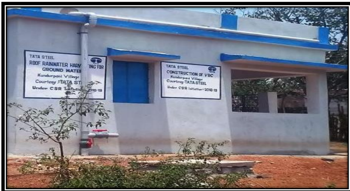
Construction of roof rain water harvesting structure for (recharge ground water) at kundrupani village.

We used VRC Kundrupani for collecting of rain-water and channel it through PVC pipes and collect it in 2 nos. of soak pits for recharging into the ground. Our objective is to use roof rainwater in recharging the ground water which otherwise flows and gets wasted.