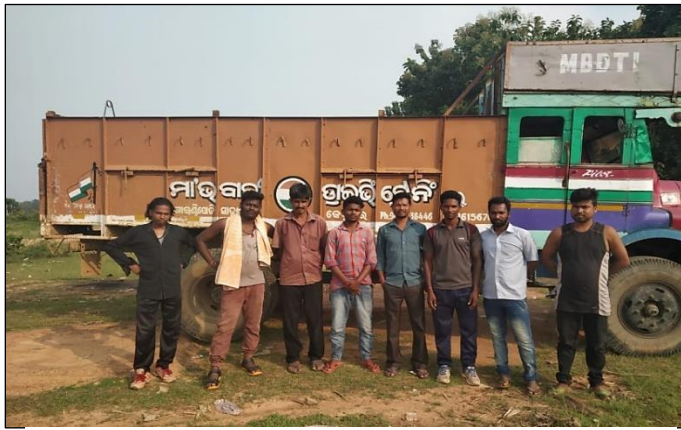
During Practice Session at the Ground