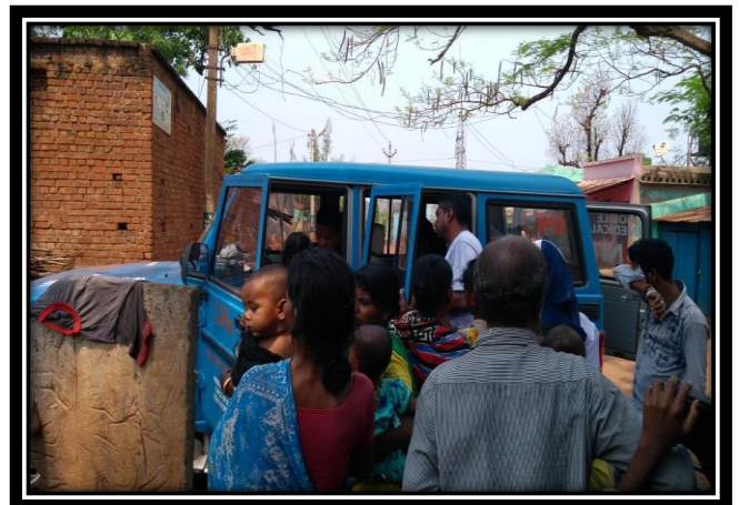
Visit of mobile health care unit to Kundurupani village on weekly schedule