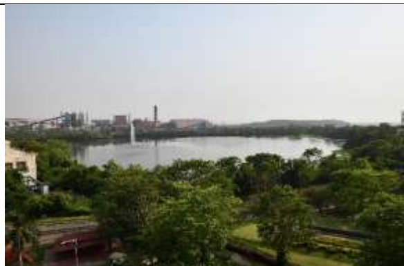
Greenery inside Works