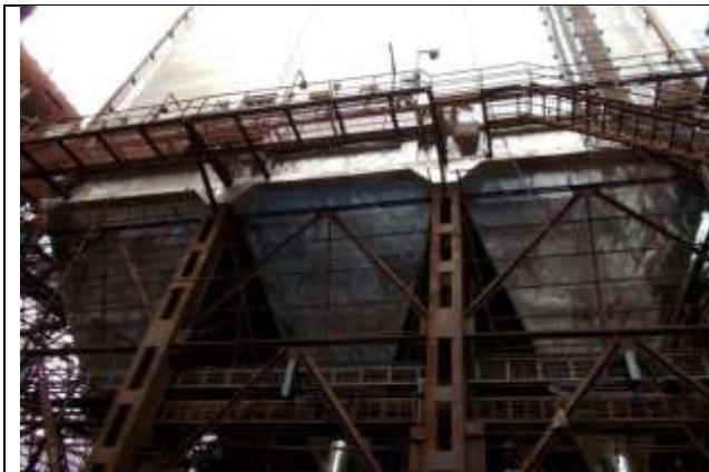
Sinter Plant 1 Waste Gas ESP