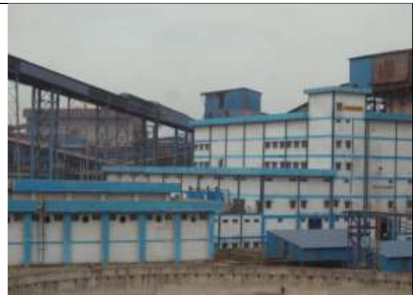
Reverse Osmosis Building