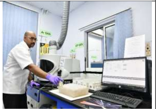
ICP at EMD Laboratory