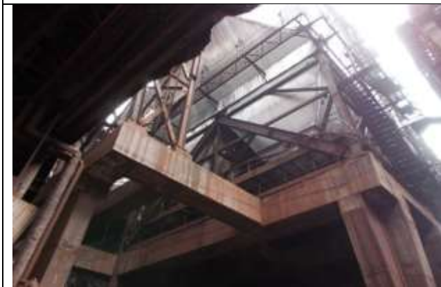
Sinter Plant 2 Refurbished ESP