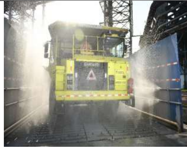
Tyre Washing Facility (TWF)