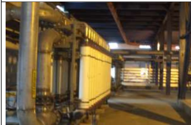
Reverse Osmosis Plant