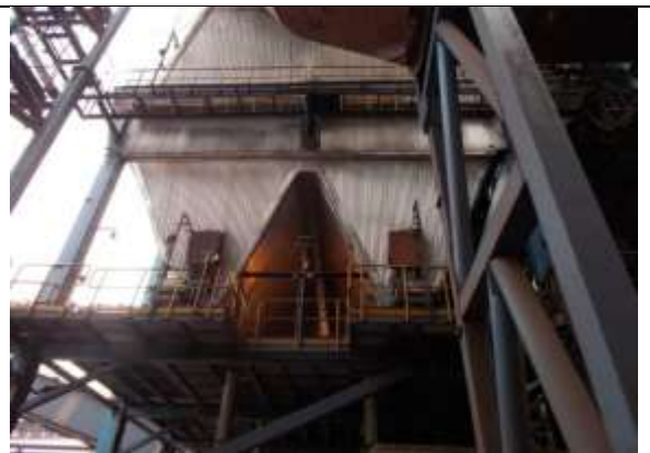
Sinter Plant 3 Refurbished ESP