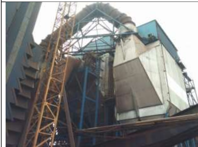
Sinter Plant 3 New Waste Gas ESP