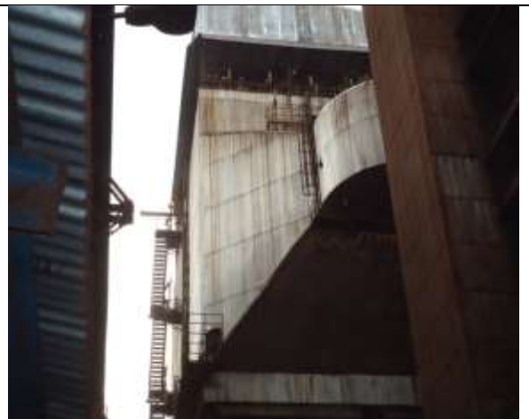
Sinter Plant 2 New Waste Gas ESP