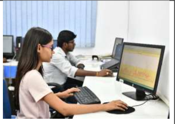
OCEMS Central Server Room