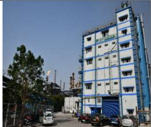
CDQ 40 MW Power Plant