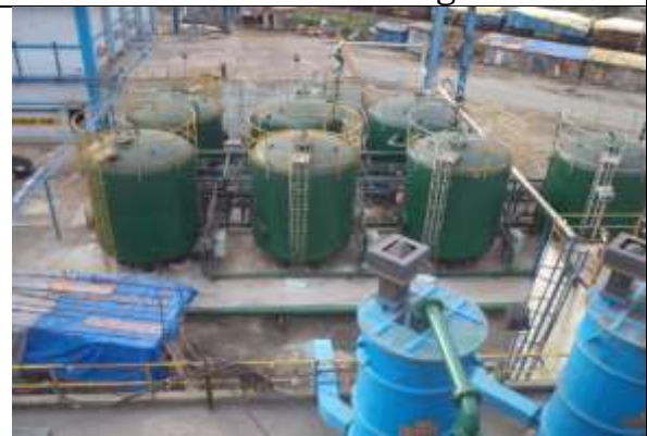
Side stream filter of CETP