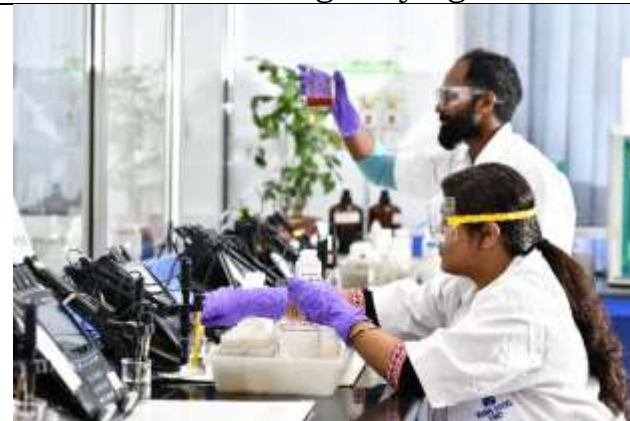
NABL Accredited EMD Laboratory