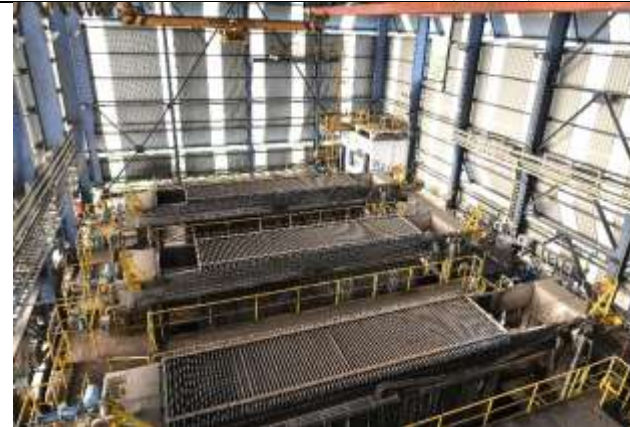
Blast Furnace Sludge Drying Plant