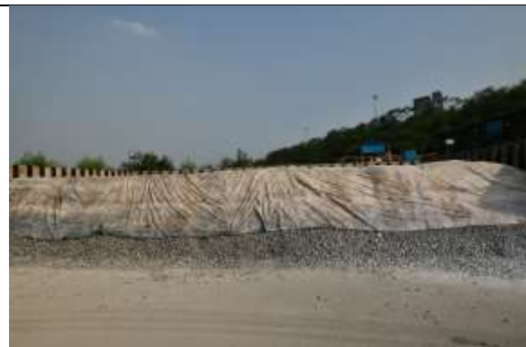
Open Steam Aging plant for LD Slag