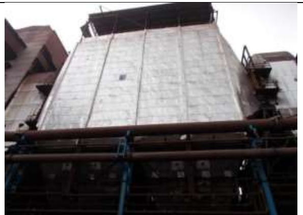
Sinter Plant 2 Waste Gas ESP