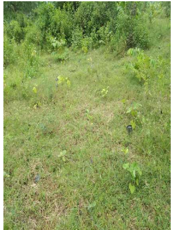
Pictures: Plantation of around 4000 forestry plants in Patia area during this monsoon season.