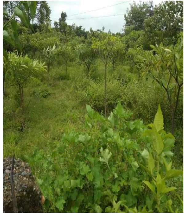
Picture: Already developed green belt in Patia area