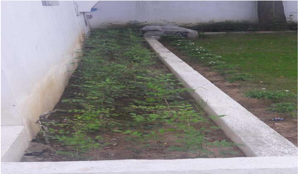
Picture: Plantation done in this monsoon inside the creche area of 6&7 pits colliery.