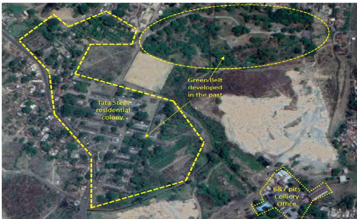
Picture: Green belt in and around 6&7 pits colliery premises.