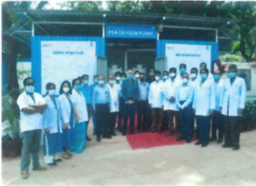
PSA Oxygen Plant installed at TSH-Noamundi