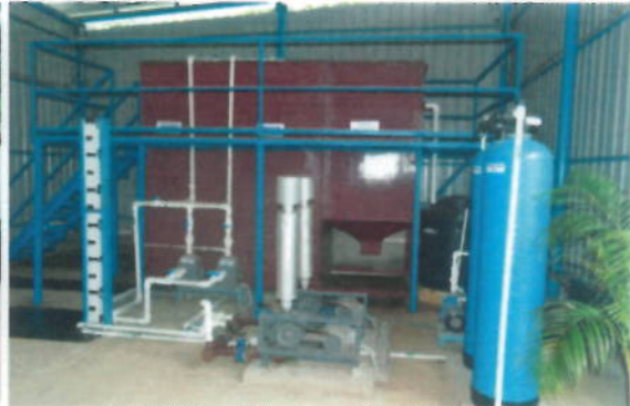
10KLD Effluent Treatment Plant (ETP) at Hospital