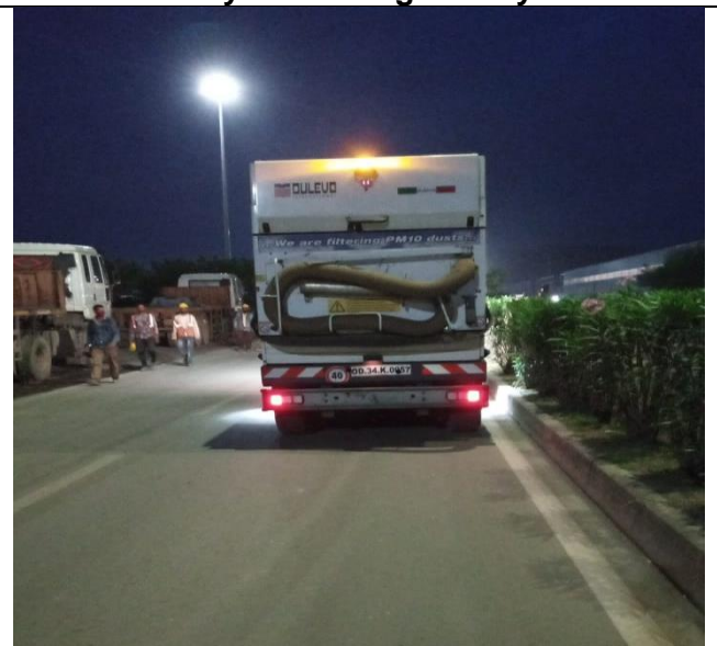
Mechanised road dust sweeping