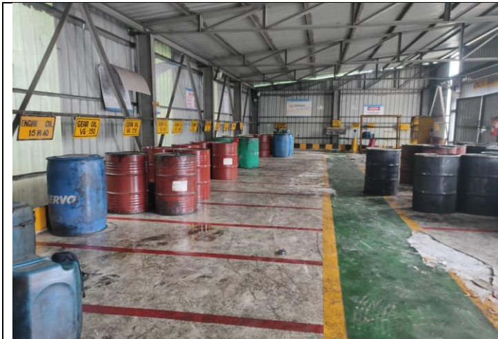
Barrel Storage Shed