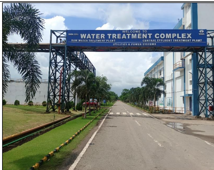
Water Treatment Complex at TSK