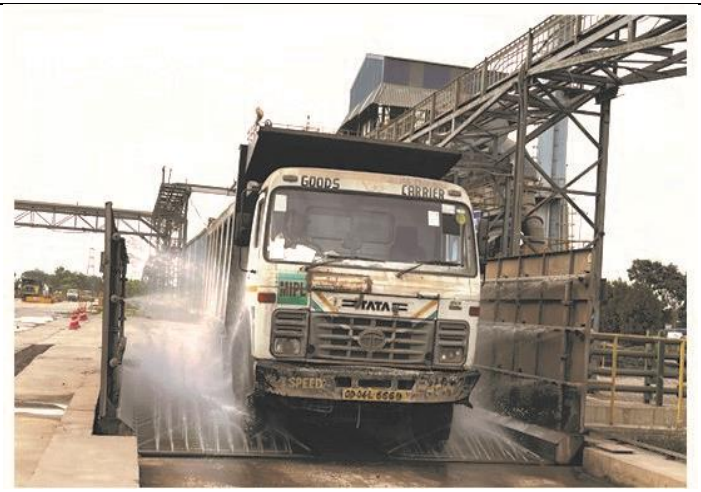
Tyre Washing Facility