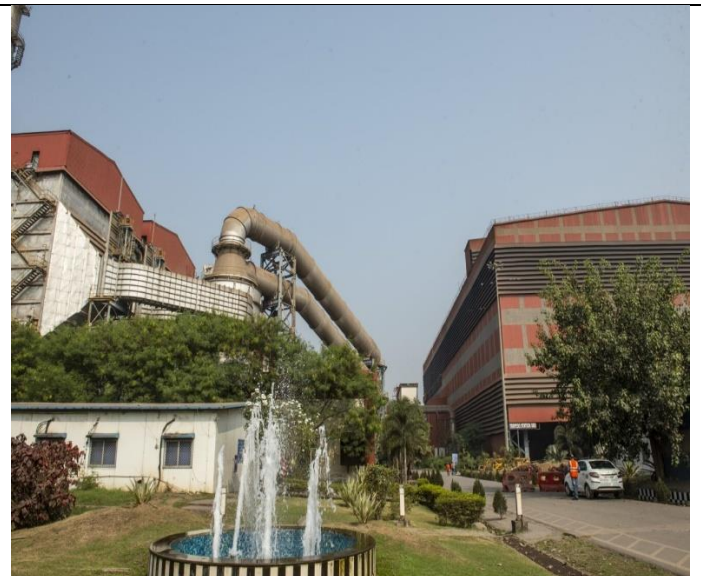
Plant Aesthetic view