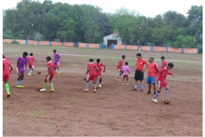
Support of Football Kit to U-10 Football player and coaching by expert Coach

We are running Under 10 Football training centre at Tiringpahar, where 10 nos of players are getting trained. Through this initiative we are promoting culture of sports in the younger generation. We are providing platform to the new & young talents to display and hone their skills.