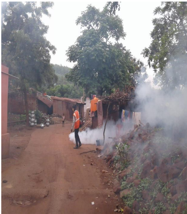
Fogging at Guruda village

Further to motivate communities to adopt sustainable sanitation practices and facilities through awareness creation and health education. Nukad natak on Swachhta, Dengue and malaria was played at various location of mines site, schools & villages. Further people are counselled in small groups to adopt hygiene practices like hand wash and open defecation. We are also doing anti larva fogging in peripheral villages to control mosquito breeding and reduce chances of human health disease.