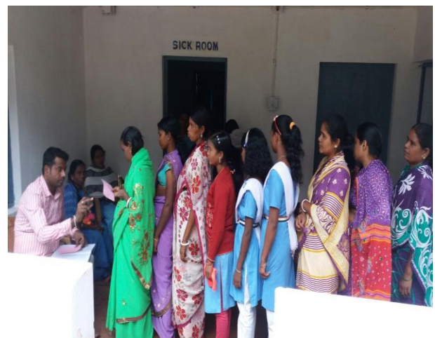
Gynecology camp at Palsa Kha Village