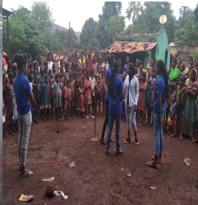
Dengue awareness with nukkad natak at Palsa- Kha village