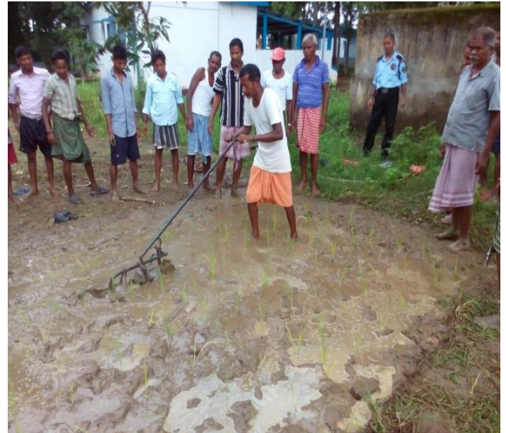
SRI Training at Green Collage Colabera (Jamshedpur)

Paddy is the only crop produced in many villages of our periphery. We are promoting skill development of farmers through advance training in Green Collage colabera, Jamshedpur. This training enhanced capacity building of famers. The main objective of this project is to enhance the agricultural yeild of marginal farmers by improving method of rice cultivation and enhance their capacity through training and exposure. The farmers who got advance training will give field level training to other farmers.