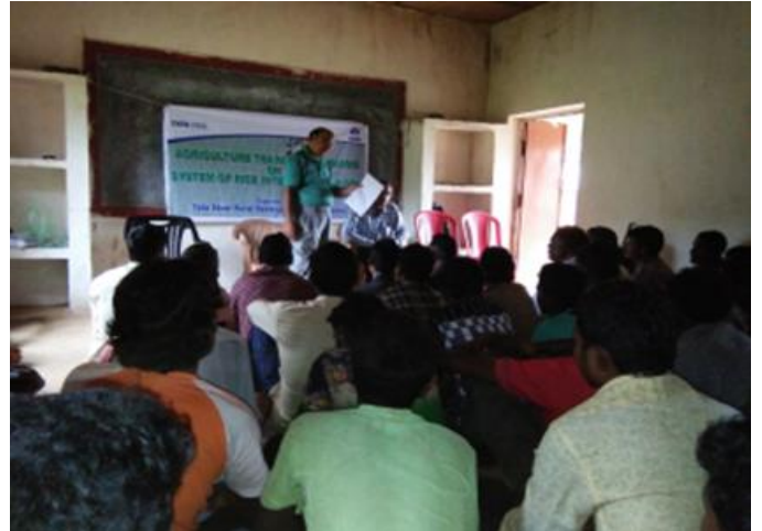
Agriculture Activities (SRI and dryland farming & Village level Training) in Nayagarh Village

Paddy is the only crop produced in many villages of our periphery. We are providing & implementing System of Rice Intensification (SRI). The entire project cost Rs. 40,000 . In FY' 17-18 we worked with 119 farmers in 107 acres of land in Nayagarh, Brahmnidih & Kotpalli Village. The main objective of this project is to enhance the agricultural yield of marginal farmers by improving method of rice cultivation and enhance their capacity through training and exposure. The field level training of farmers and farm visit were organised with support of District Agriculture Department. Field levels helped farmers by giving greater insights of SRI cultivation.