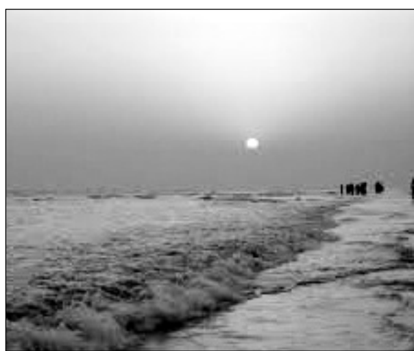
Sunset at Bakkhali

The very definition of a virgin beach resort, Bakkhali is a peaceful beach town that is hardly ever crowded, save the occasional longer weekends. It is an excellent place for cycling or taking long walks and just having a holiday where you do not feel the burning need to get up and do something. The break is ideal for early winter if you feel like swimming in the clean waters of this virgin paradise.