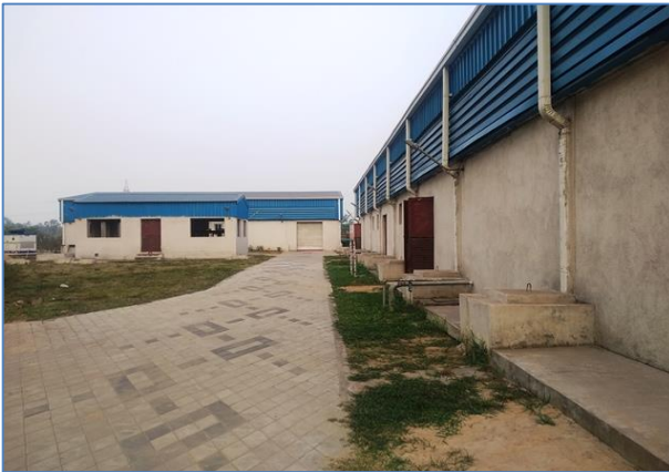
STP at Residential Complex