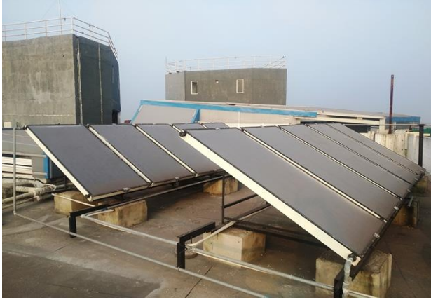
Solar Panel at Roof top