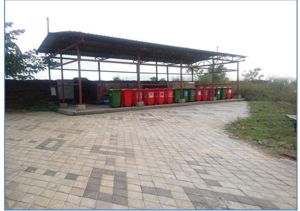
Garbage Segregation System