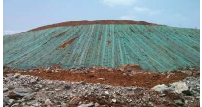
Coir matting over dump