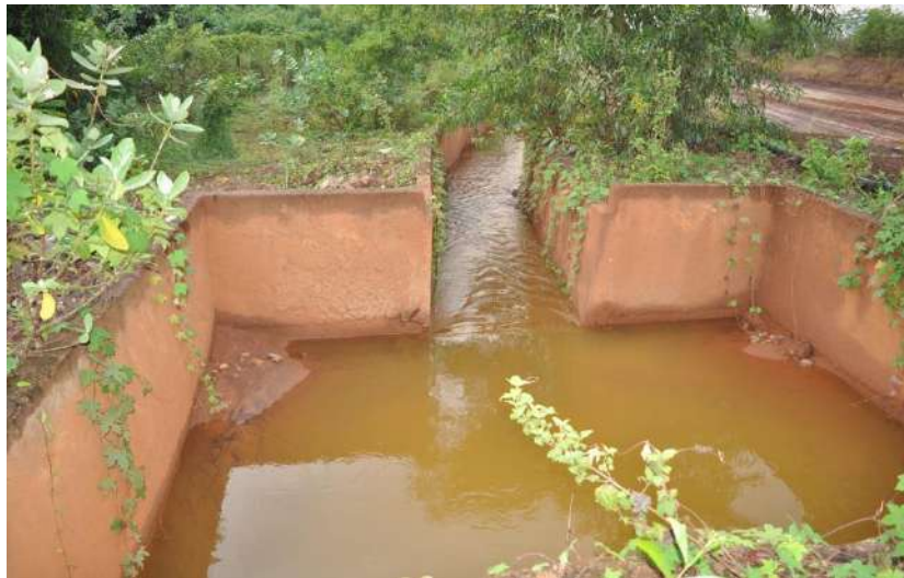
Settling pit and Toe wall