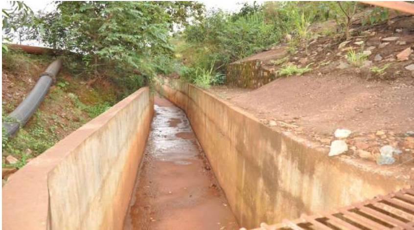
Concrete Garland drain