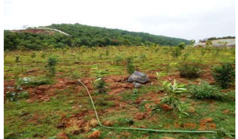
Plantation over dump