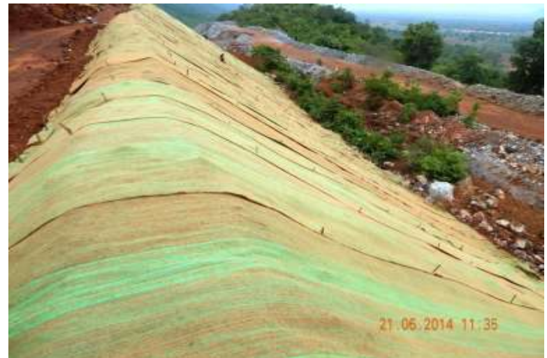
Inwardly Slope Dump Top