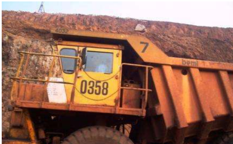
Air tight air conditioned cabin in HEMM