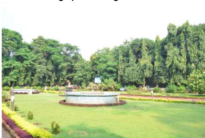
In front of Mine Office