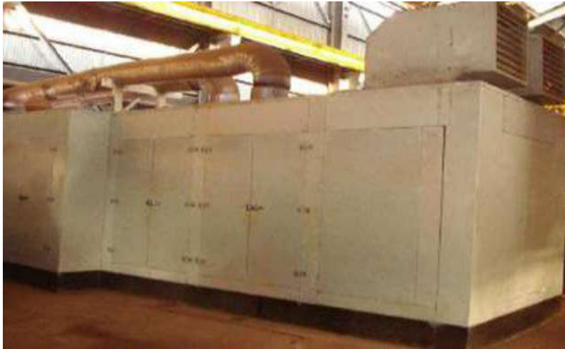
Acoustic enclosure for DG set