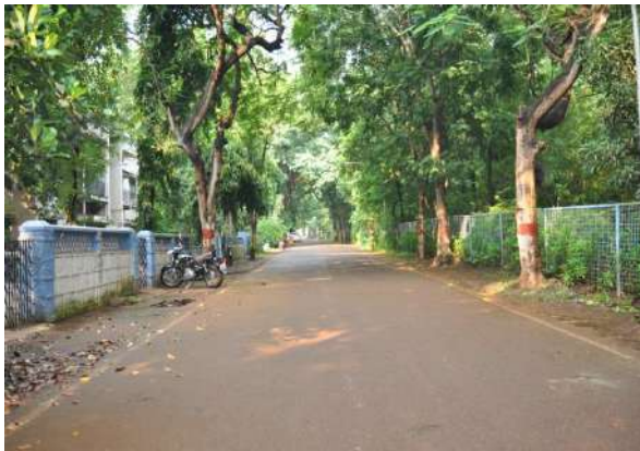
Between Workshop and Colony