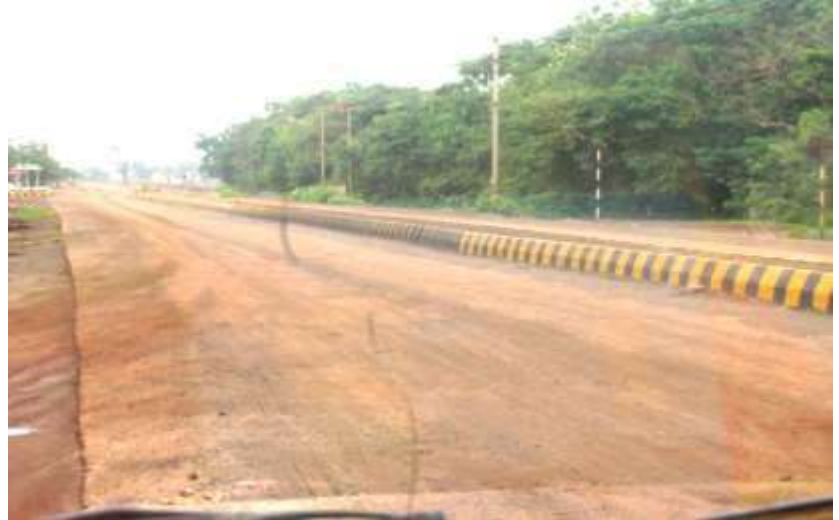
Photograph showing concrete roads