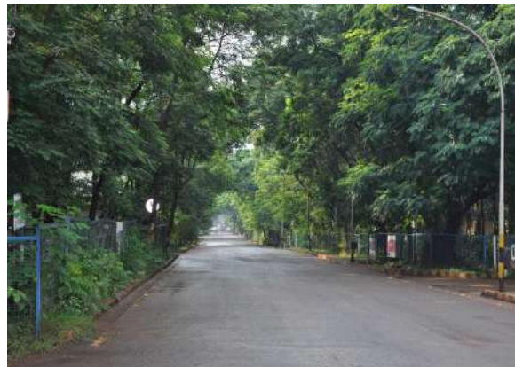
Along Northern Boundary of Lease