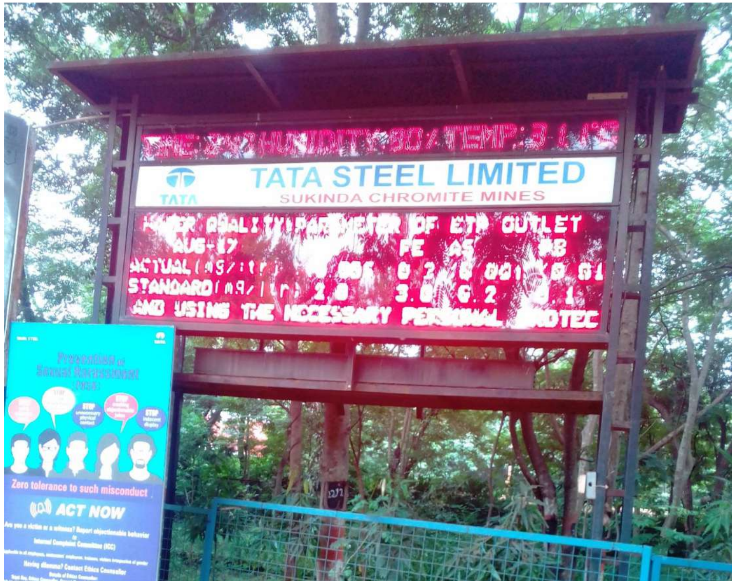
Annexure - IX Multiline electronic display board at the Mines gate