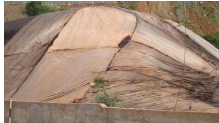
Photograph showing Chrome Concentrates covered with tarpaulins