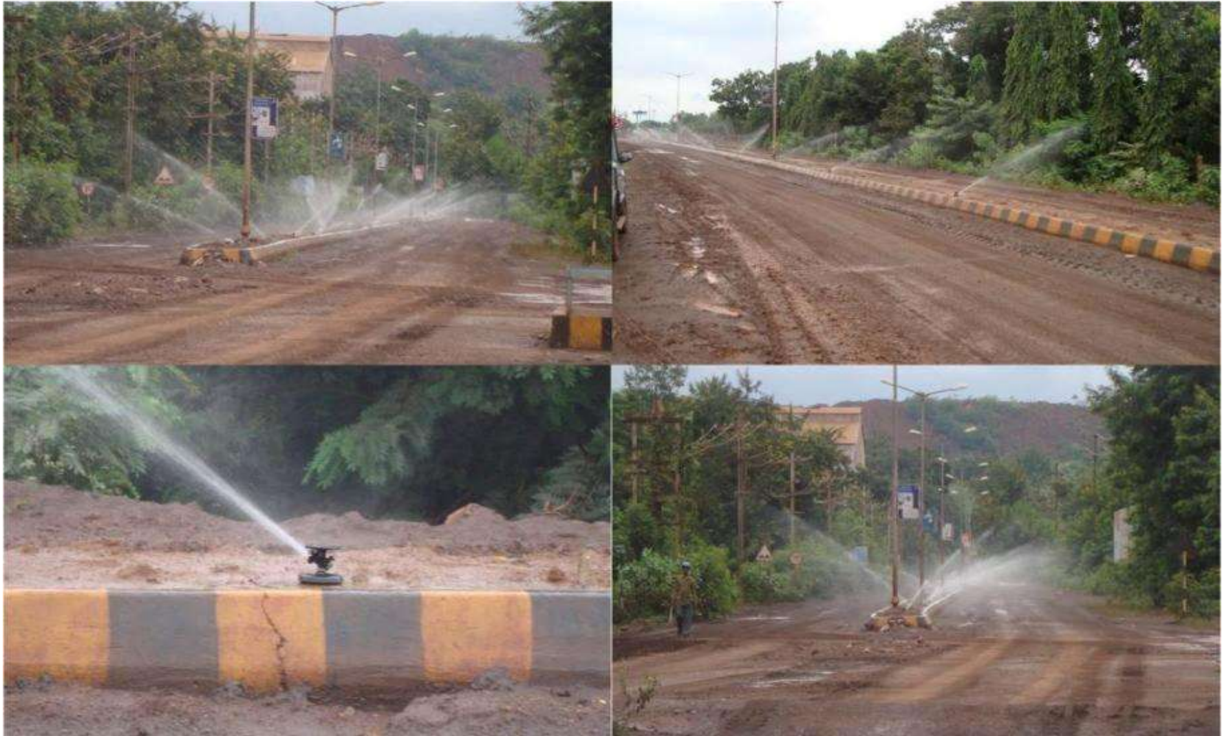
Stationary Water Sprinkling System