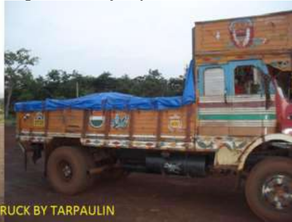
COVERING OF TRUCK BY TARPULIN