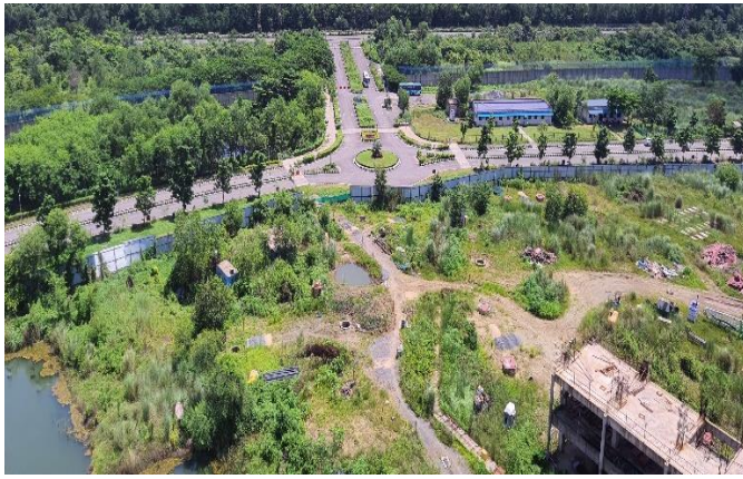
Green Belt view