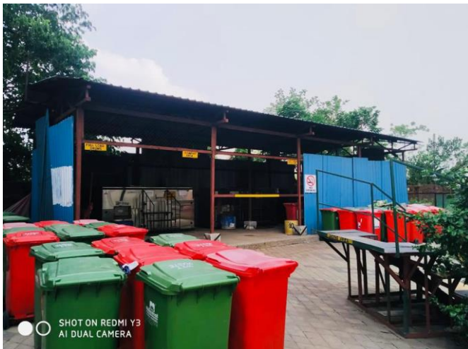
Organic waste composting machines are in operation