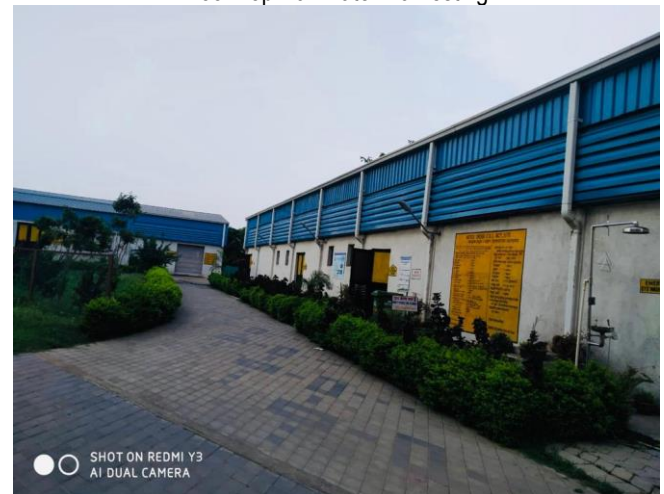
1000 KLD Sewage Treatment plant in operation