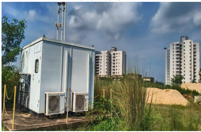
Continuous Ambient Air Quality Monitoring Station installed