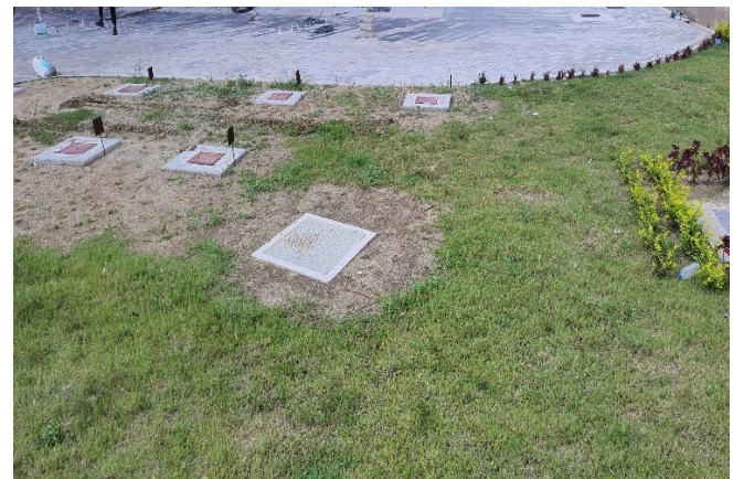
Roof Top Rainwater Harvesting