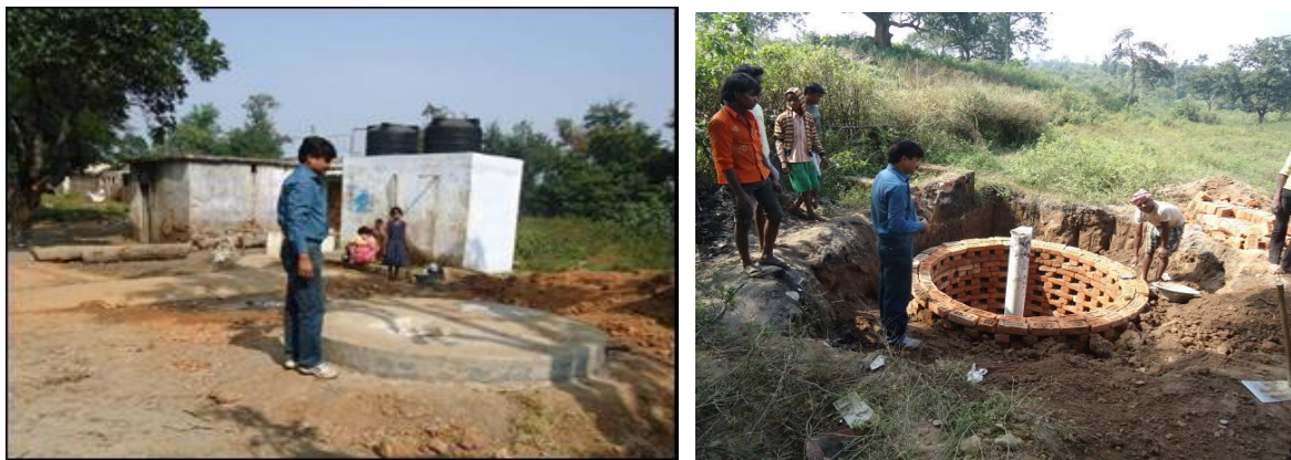
Artificial ground water recharge pit (Bore well) in Bilhore village

The ground water recharge measures are continuously being taken up. In this year thrust has already been put up to streamline drinking water projects, which includes construction of ponds, bore well, check dams etc. in and around our leasehold areas. The projects also include construction of rain water harvesting structures, installation of water filtration plant, in surrounding villages.