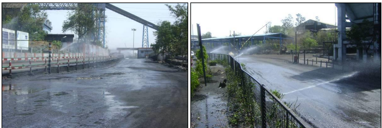
Fixed type water spraying system in Washery area

All the strategic locations of operating plants where the possibilities of fugitive dust emissions, has been provided with adequate enclosures, side skirt, chute, seal plate, sealing of transfer points along with adequate dust suppression system. All the sites are monitored regularly (once in a month) and data is kept for record. The haul road, loading and unloading points are provided with pressurized water tanker for water spraying moreover, wagon loading does not require any water spraying since the coal is in moist condition.