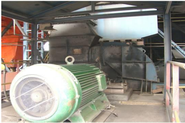
New FD Fan with Silencer leads to significant reduction in noise generation

Control measures are being taken up to keep noise level well within limit in working environment by providing adequate enclosure/ separation to the various high noise sources, proper maintenance, provision of control room, operator's cabin etc. In addition all the persons are provided with PPEs such as ear plug/ muff during work. An adequate green belt is also maintained in the area.