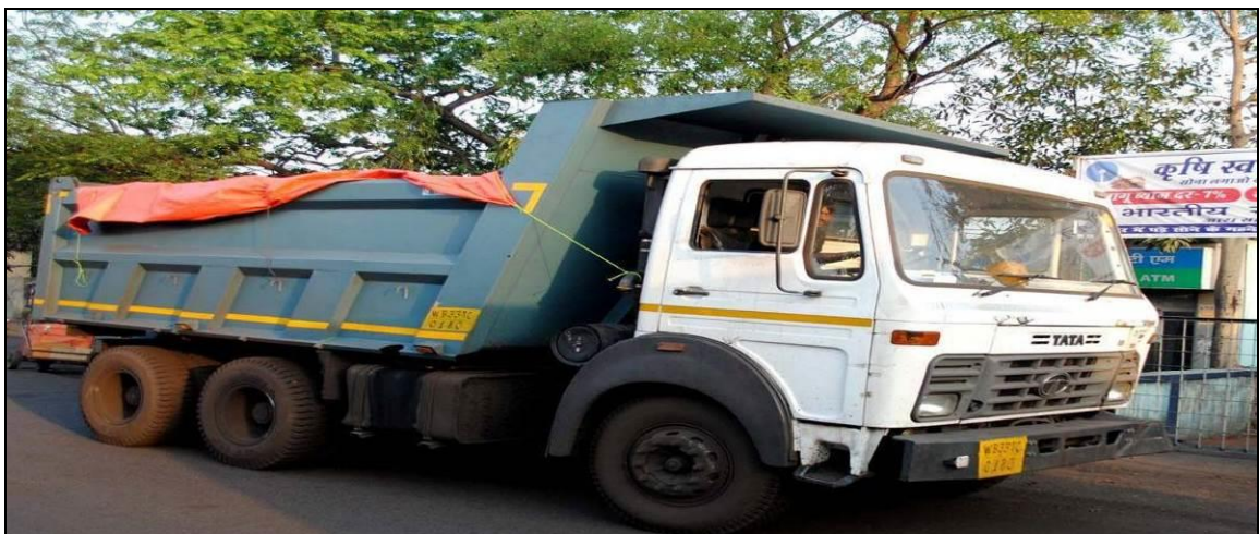
Transportation of mineral (Coal) in covered truck

Vehicular emission is kept under control by regularly monitoring the vehicles. Overloading of vehicles is avoided during mineral transport. Adequate maintenance of vehicles is done. All the vehicles during transport of material covered with tarpaulin sheet. In future, the mineral transportation will be done by Pipe conveyer.