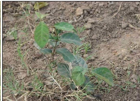
Hemidesmus indicus (Annantmull)