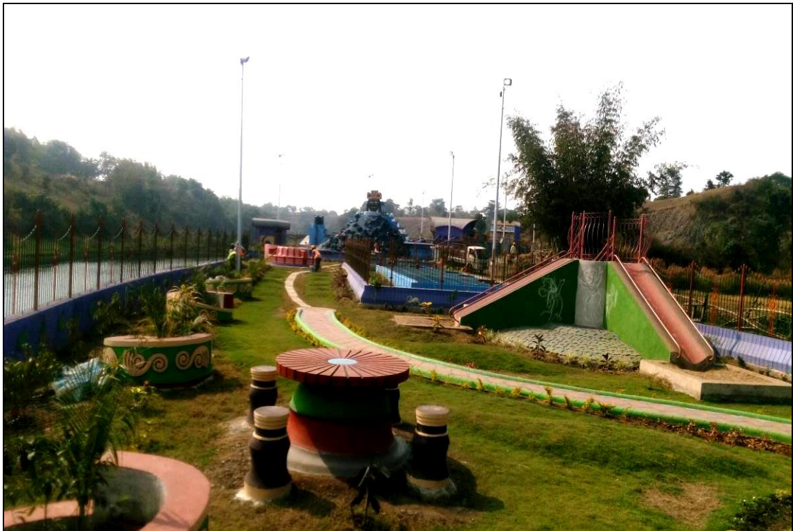
Drinking Water Project