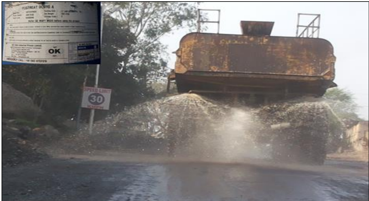
Pressurized water spraying in mines area with chemical dosing

A mobile vacuum cleaner of 20 T capacities is used to recover any spillage during operation immediately. Adequate maintenance of vehicles are done, to avoid any spillage during the transportation.