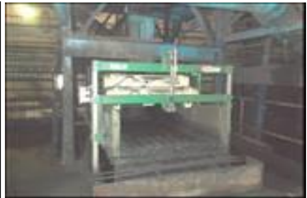
Mechanical tailings de-watering system