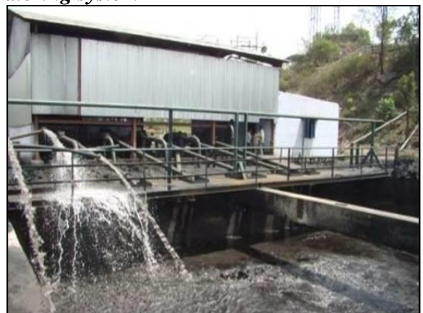
Effluent recycling in washery