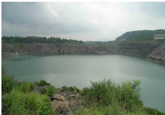
Abandoned mine pit being used as water reservoir

Some of the dump site located in deep most area followed by mine pit of adequate size to arrest sediment from soil, OB. After proper sedimentation the water is being used in spraying & watering to plants. Construction of garland drain is a regular practice to take care of run-off water in the mining operation. The details of garland drain are top width varies in between 6m to 10m & bottom width is kept at 3m. Depth varies from 2m to 7m. The sump capacity is in order of 48-120 million gallons considering maximum rainfall of 150 mm in 24 hrs which leads to accumulation of 28-48 million gallons water depending upon the catchment area. Accumulated mine pit water being used in industrial and domestic purpose after necessary treatment. One of the de coaled area of 12 ha in query E site is being used as water storage area to collect rain water, catchment water etc.