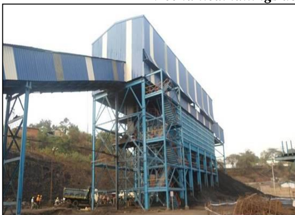
Coal transport by conveyor belt