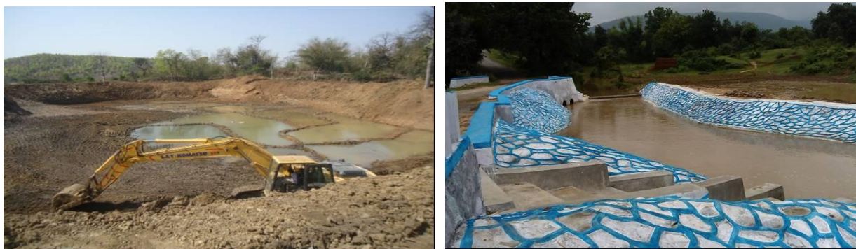
Rainwater Pond at Parsabera

However, various water conservation measures are also taken for ground water augmentation.