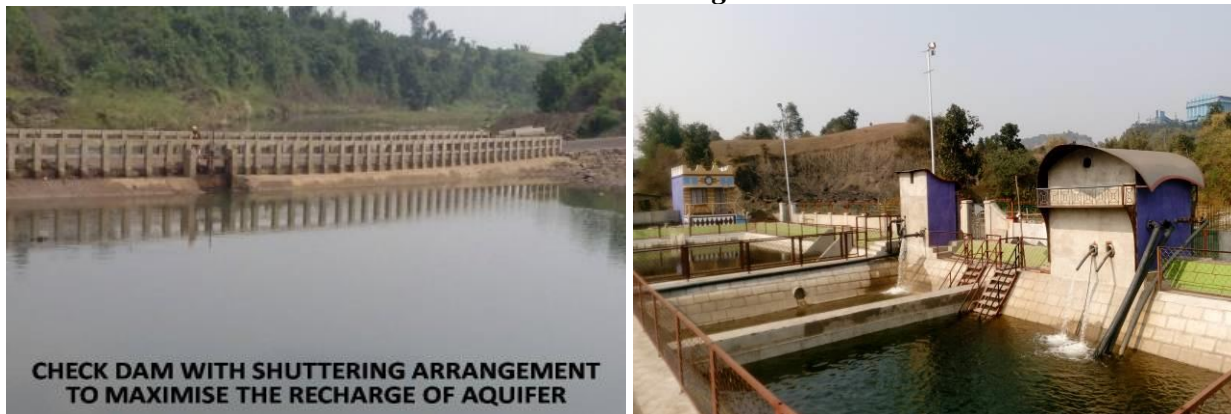
CHECK DAM WITH SHUTTERING ARRANGEMENT TO MAXIMISE THE RECHARGE OF AQUIFER