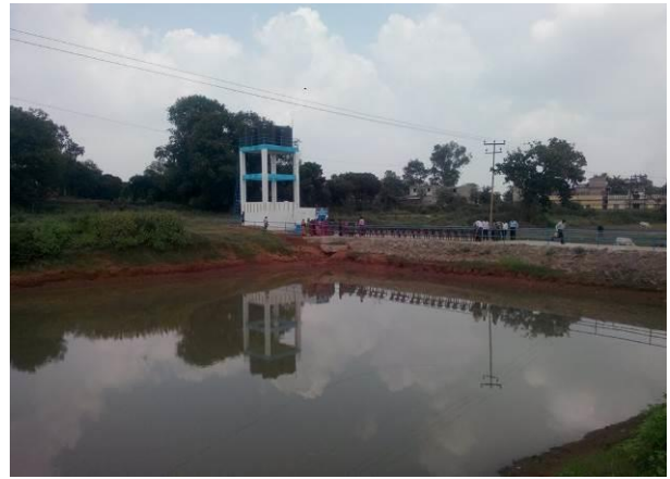
Drinking Water system at Atna village