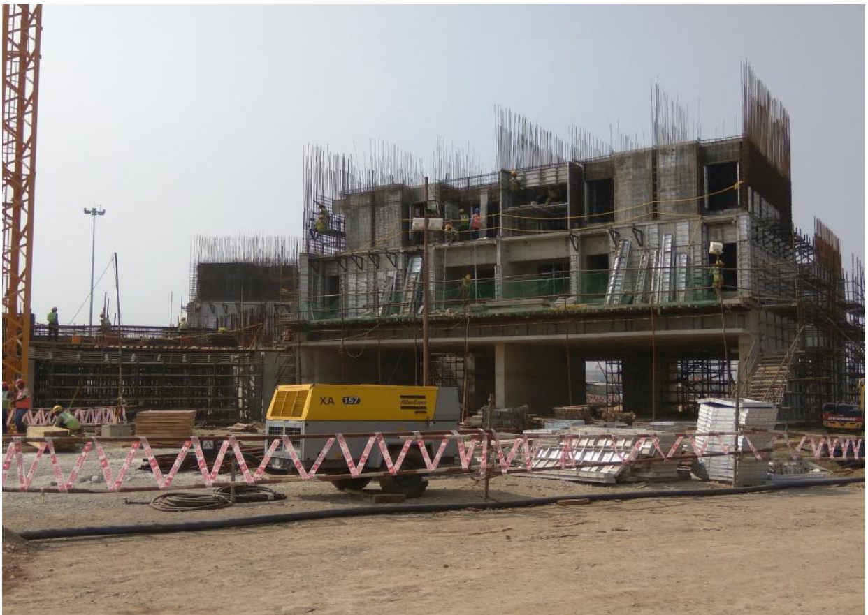
Building construction in progress