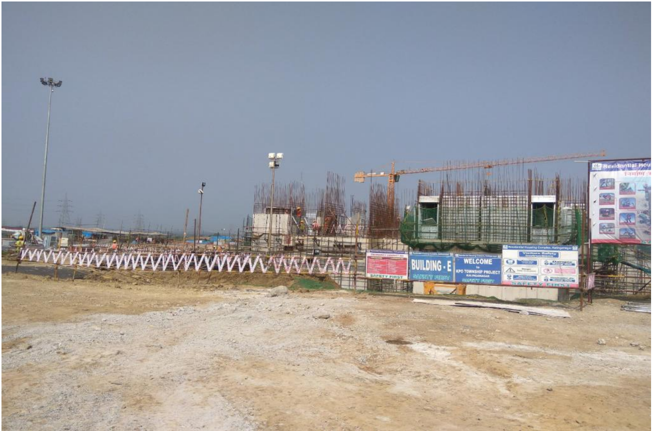
Construction activities at Site