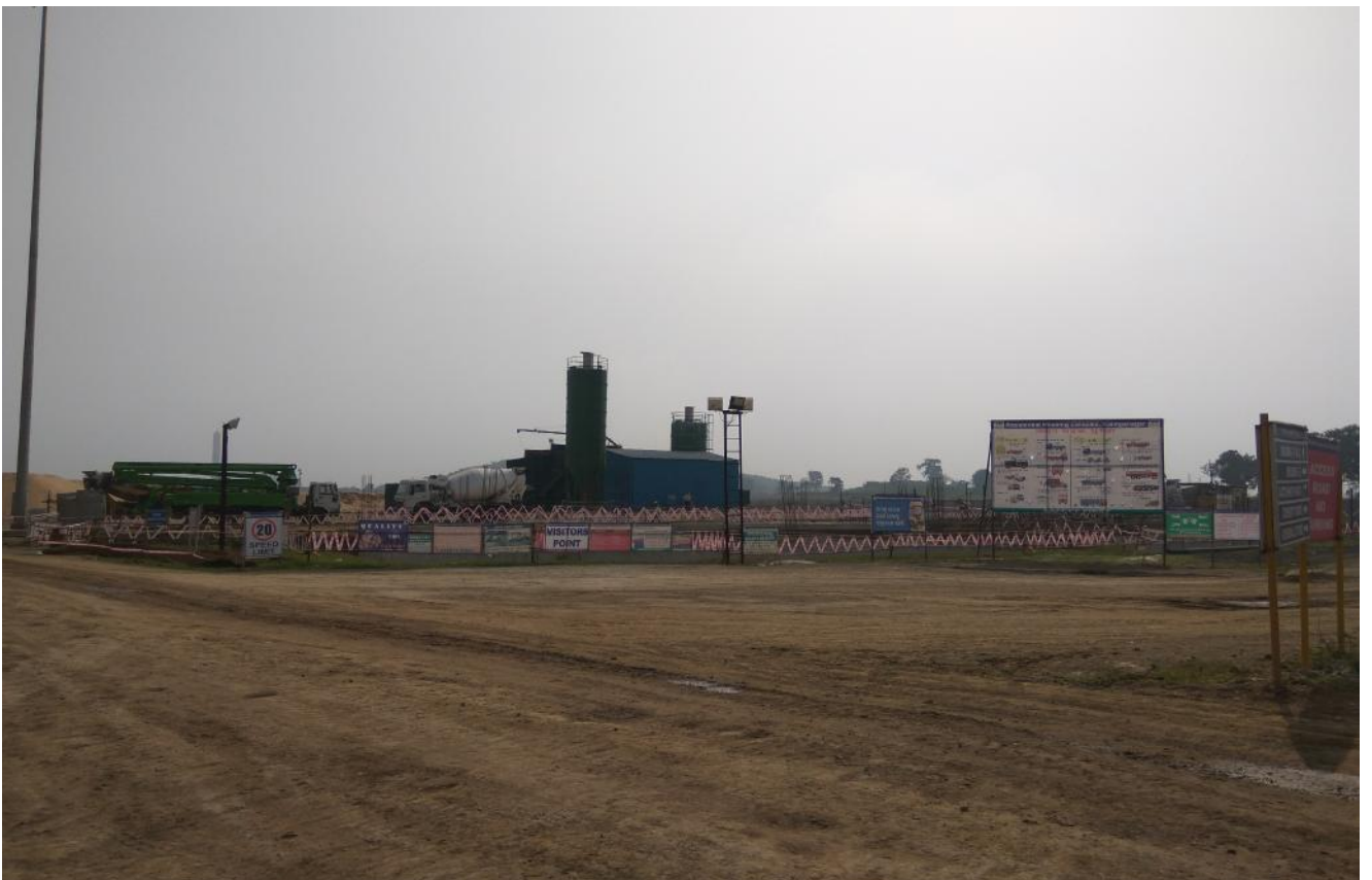
Batching Plant at construction site