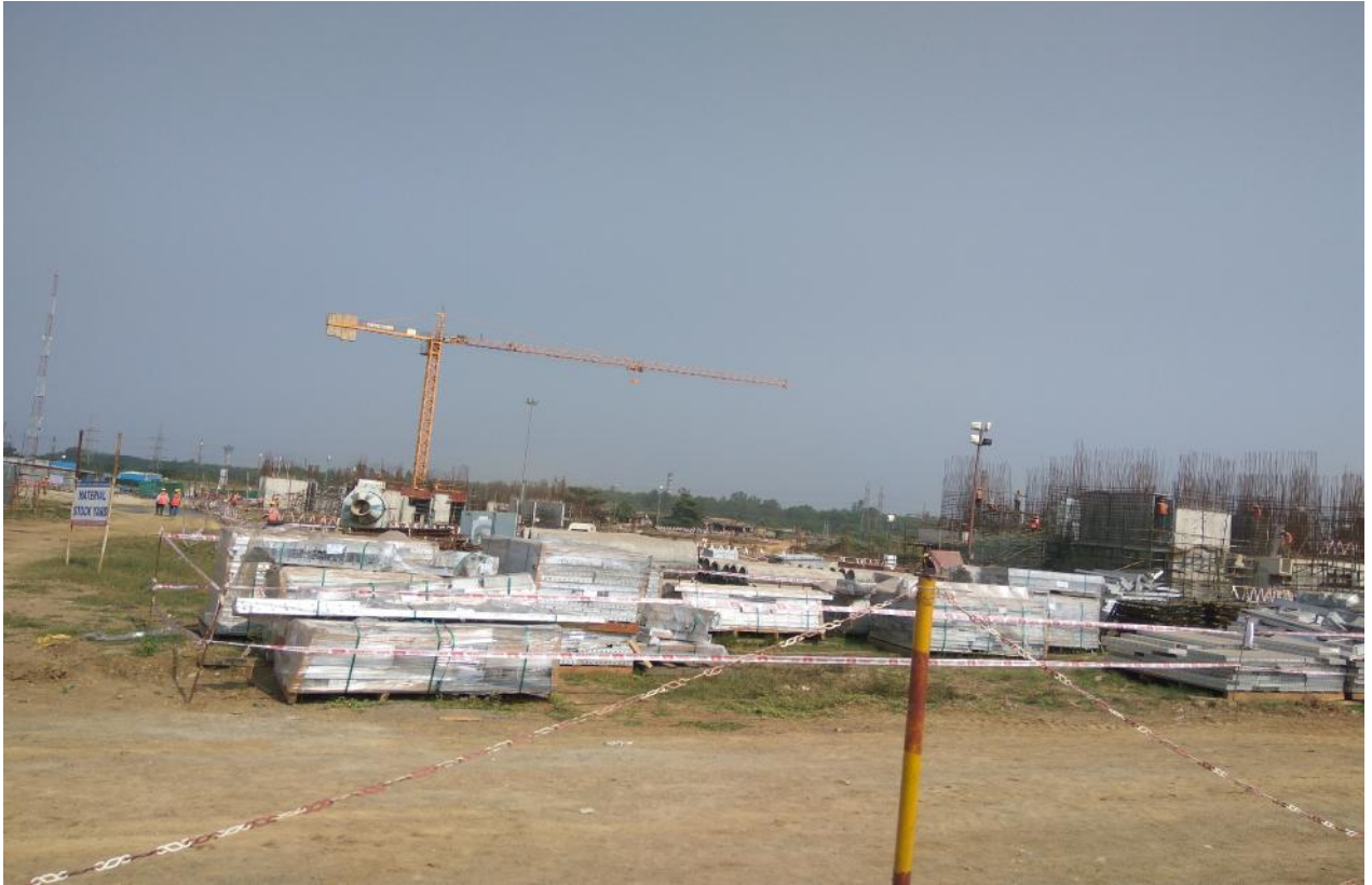
Stacking of construction materials at construction site