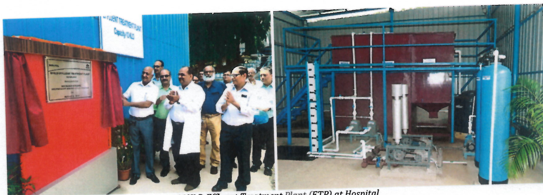
10KLD Effluent Treatment Plant (ETP) at Hospital