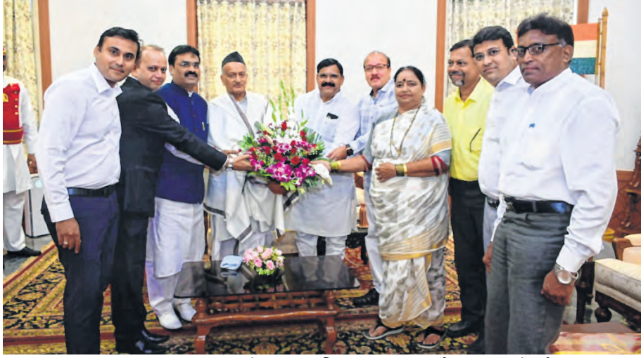
आपद्ग्रस्त मच्छीमारांना मदत मिळण्यासाठी कोळी महासंघाने राज्यपाल भगतसिंह कोश्यारी यांची भेट घेऊन निवेदन दिले.