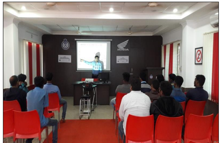
During Classroom Training