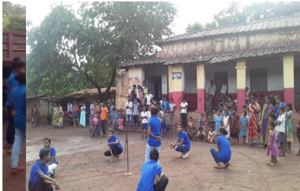
Dengue awareness with Nukad Natak at Plasa Ka village

Further to motivate communities to adopt sustainable sanitation practices and facilities through awareness creation and health education. Nukad natak on Swachhta, Dengue and malaria was played at various locations of mines site, schools & villages. Further people are counselled in small groups to adopt hygiene practices like hand wash and open defecation we are also doing anti larva fogging in peripheral villages to control mosquito breeding and reduce chances of human health disease.