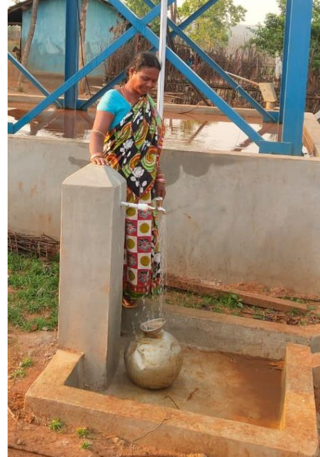
Solar power drinking water project at Gurutuan village

Community people and key stakeholders have requested us for provide drinking water facility in Gurutuan village. The villagers have problem of drinking water especially in summer season. They used water form Baitarni River. It was half kilometer from village.