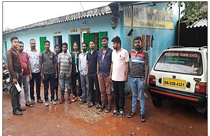
Youths at the Driving Training Institute

One month residential training was provided by the Institute which is affiliated with State Transport Authority, Odisha. It has all basic infrastructures like classroom, Light vehicles, Heavy vehicles and training ground. The Institute gives a 30 days training to the candidates which gets verified by HMV Inspector and further Final Driving License is issued to the successful candidates. A total 8 nos of unemployed youth from operational villages of Khondbondh, FAP and OMQ area were provided training in the 1 st batch from 20 th Sept'18 to 20 th Oct'18 . These youths have received a Driving License, Training completion Certificate and Accidental Insurance of Rs. 1.0 Lakh. 15 nos more youths has already been screened for 2 nd batch and expected to start the training from January'19.