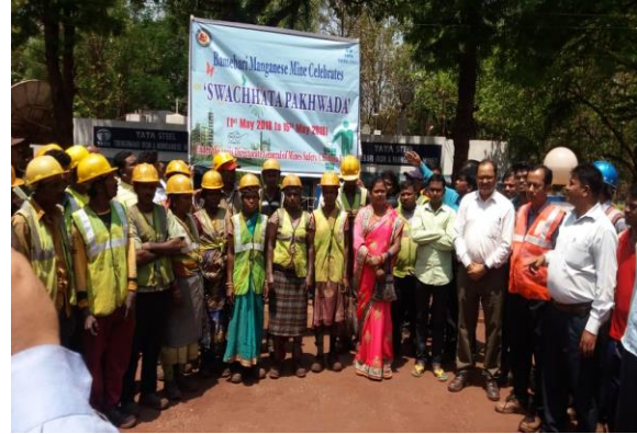
Swachata awareness campaign at public places & villages

Further to motivate communities to adopt sustainable sanitation practices and facilities through awareness creation and health education. Nukad natak on Swachhta, Dengue and malaria was played at various locations of mines site, schools & villages. Further people are counselled in small groups to adopt hygiene practices like hand wash and open defecation we are also doing anti larva fogging in peripheral villages to control mosquito breeding and reduce chances of human health disease.