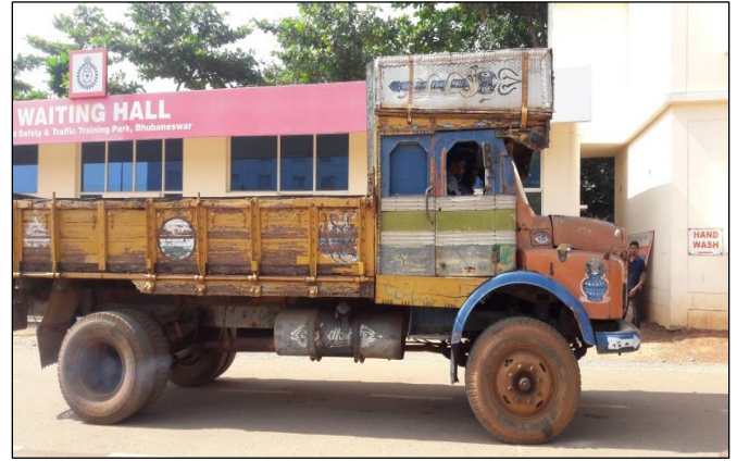
During Final License Test Drive at Bhubaneswar

Presently, these youth are practicing on Light Motor Vehicles and earning about Rs. 8000/month. After receiving HMV license more opportunities will knock their door and they would earn about Rs. 18000/month.