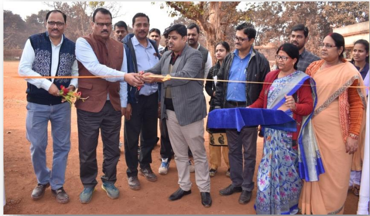
Inauguration of Mega Health Camp at SSVM, Bamebari

Besides these, specialized health camps are organized on time to time basis at different remote tribal villages to make them avail free health diagnosis and treatment.