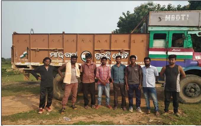
During Practice Session at the Ground