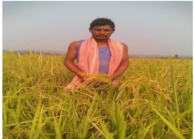
Paddy cultivation through SRI Method at Jagarnathpur

Agriculture generates livelihood not only in direct form but also in indirect form to many landless peasants. As paddy is the only crop raised in many villages of our periphery, we are geared towards supporting the farmers by providing training and technical guidance.