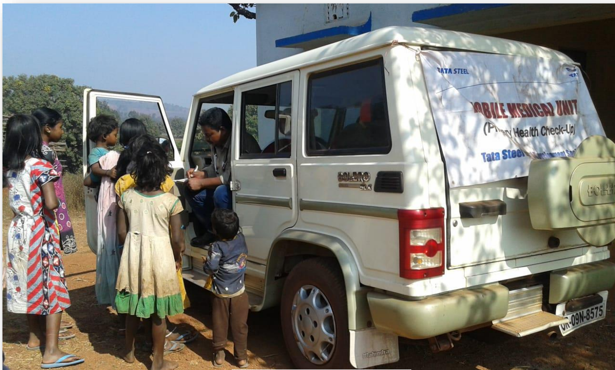
Mobile Medical Unit

Wavier for free treatment at Tata Steel hospital, Joda