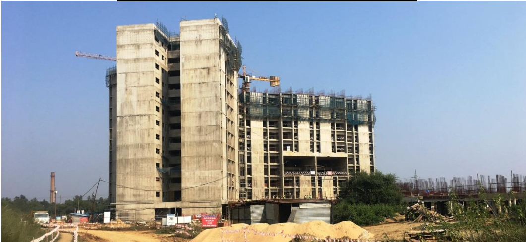
Building Construction in progress