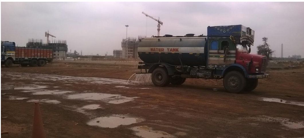
Water sprinkling at construction site for dust suppression