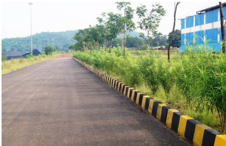
Metaled road inside plant premises