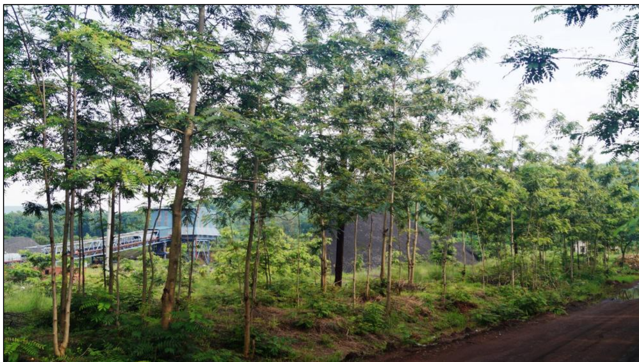
Plantation inside plant premises