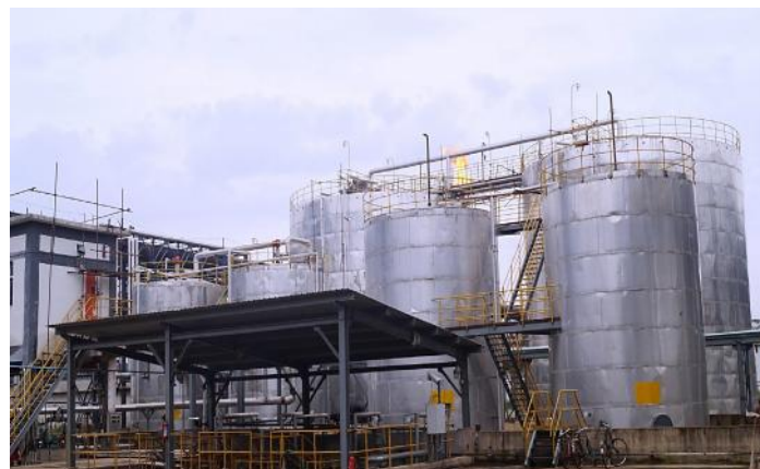
Tar Handling unit at Coke Oven By-product Plant