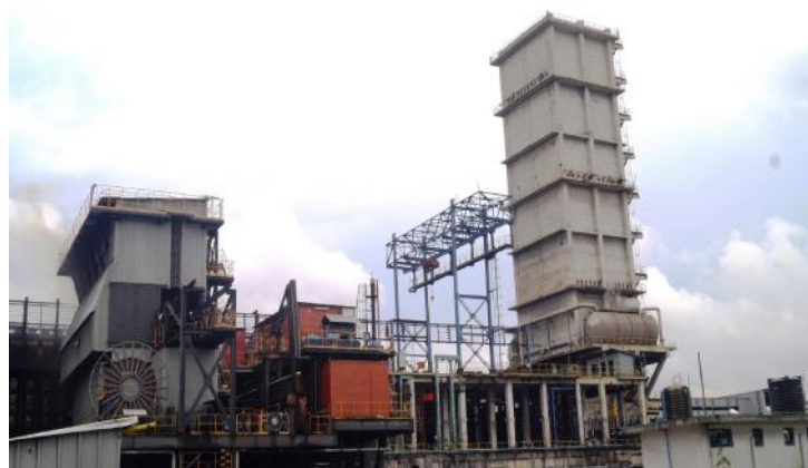
Stamping, Charging & Pushing Machine