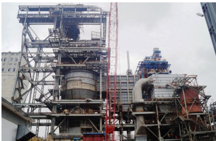
Coke Dry Quenching (CDQ) unit at Coke Oven Plant