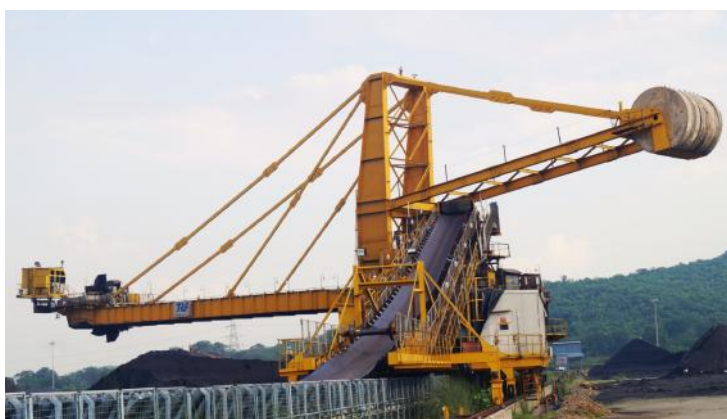
Stacker cum reclaimer at coal yard