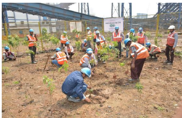
Plantation on world environment Day 2016