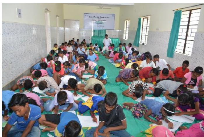
Essay & Drawing Competition for kids on World Environment Day 2016