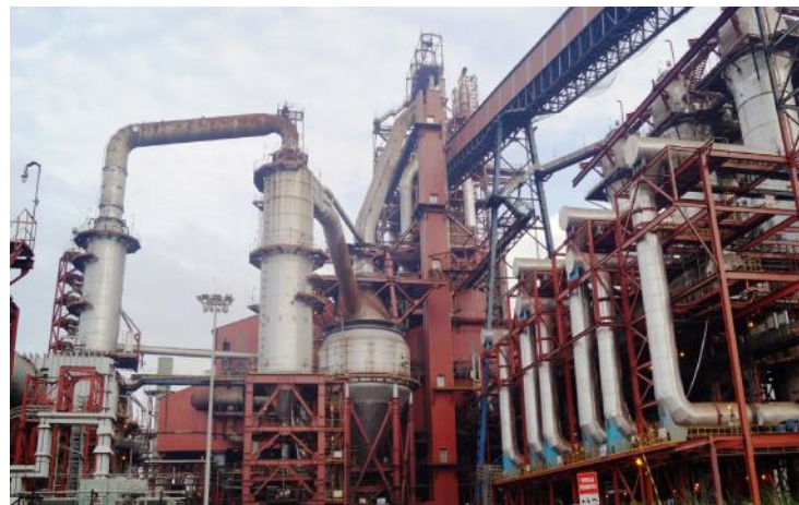
Gas Cleaning Plant (GCP) at Blast Furnace