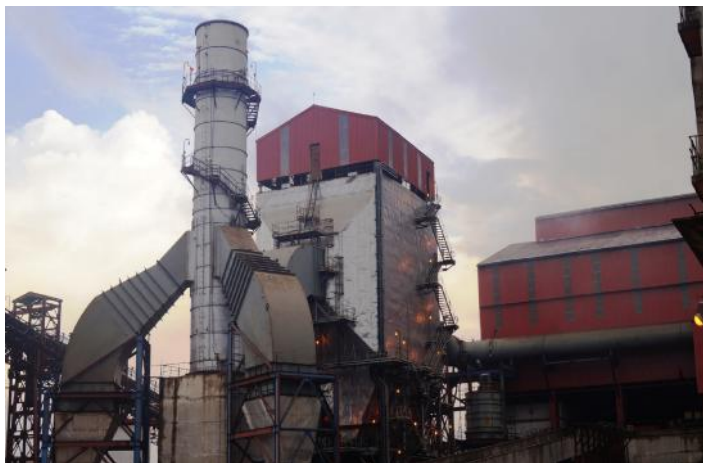
ESP at Blast Furnace Cast House