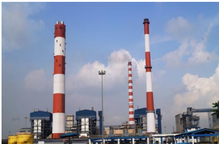
Captive Power Plant