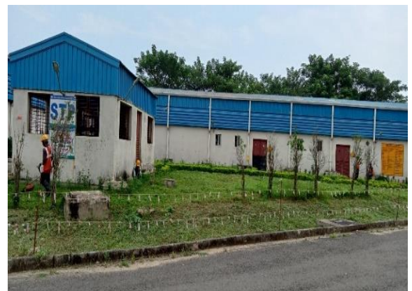
1000 KLD Sewage Treatment plant in operation