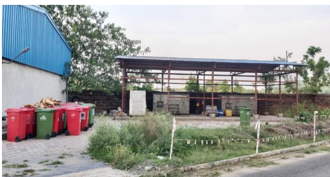
Organic waste composting machines are in operation