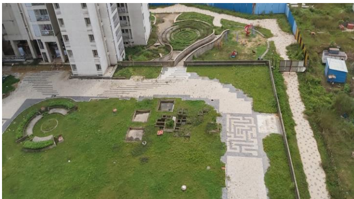
Landscaping over podium