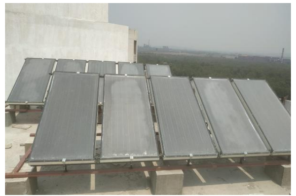
Solar Panels installed at roof top of buildings