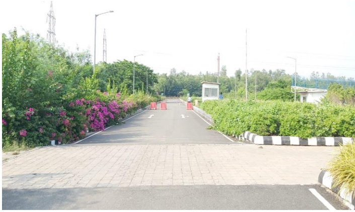
Peripheral Road along with various plant species over median