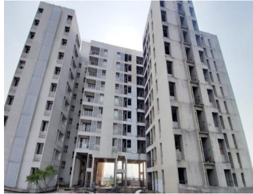
Building in progress