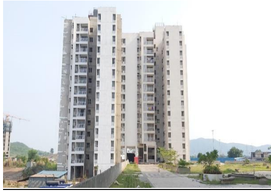
View of a block of building