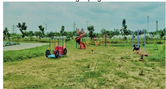
Children's park inside residential complex