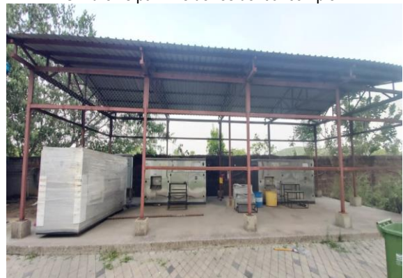
Organic waste management facility- Organic waste converter