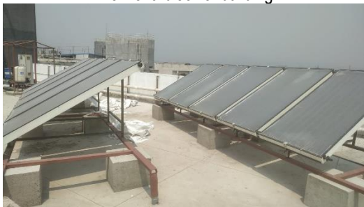
Solar panels at roof top