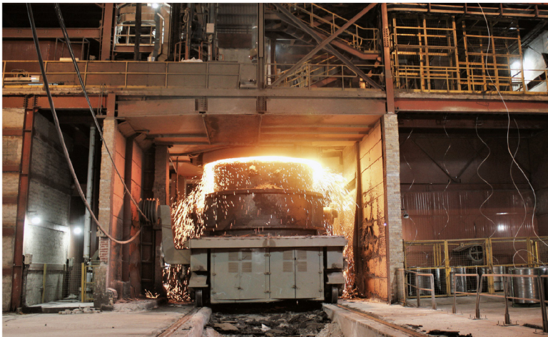
The secondary-metallurgy station at the Kalinganagar plant used analytics to increase throughput by better controlling the superheating process.

Despite the setback, managers had seen how the advanced-analytics models reduced costs and raised output. Managers also realized that classroom training alone would not prepare employees to sustain those performance improvements. They concluded that the company would need to further cultivate employees' analytics skills and transform their way of working. Their insight paid off. By building these capabilities, the plant would raise its performance to world-class levels and earn acclaim from the World Economic Forum in July 2019 as one of 44 Lighthouse sites that are leading in the adoption of Fourth Industrial Revolution technologies.