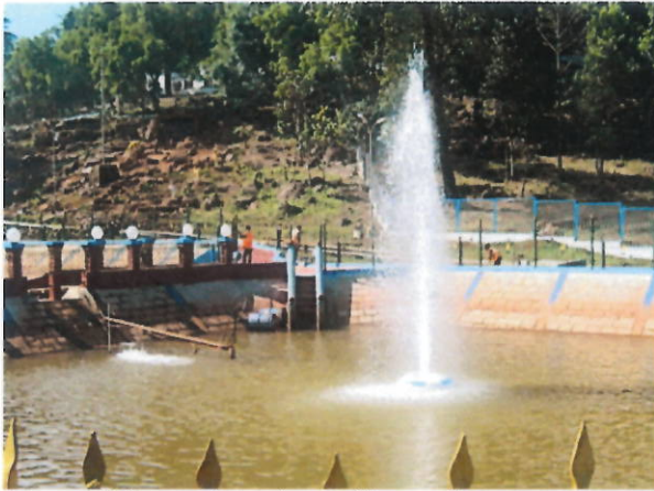
Rain water harvesting pond Noamundi