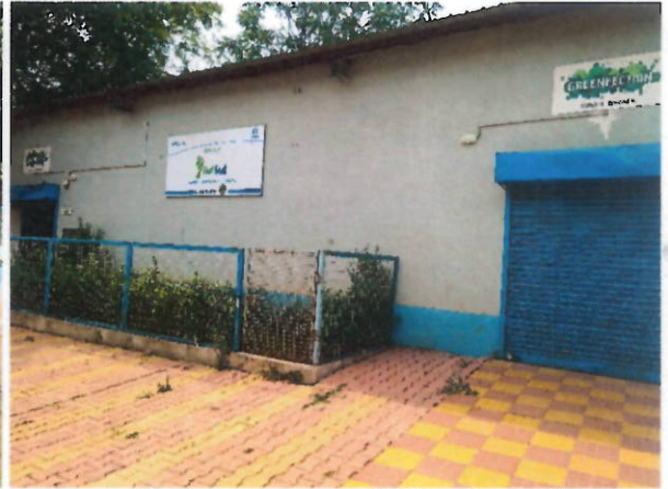
First feet - shoe recycling facility at Noamundi