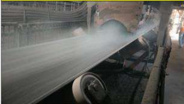
Use of Dry fog system at all transfer points in plants