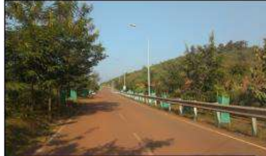
Mine road side plantation