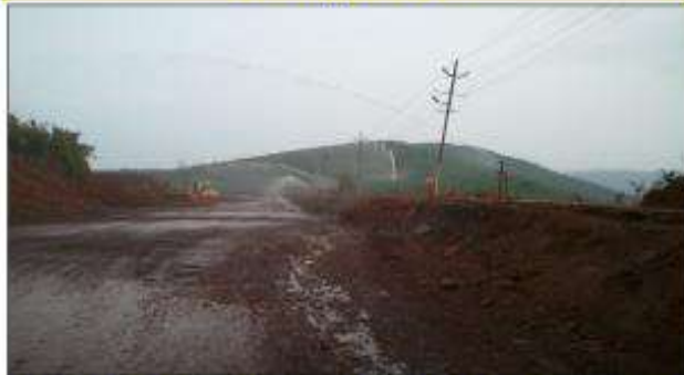
Use of fixed watersprinklers at haul roads for dust suppression