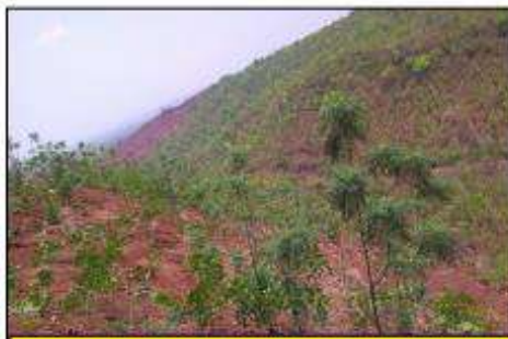
Plantation at OB dump