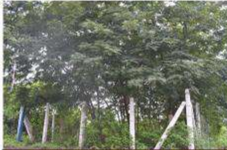
Safety zone plantation