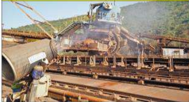
Use of water Mist Canon for dust suppression